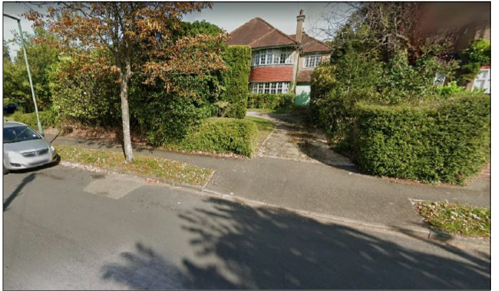
EXTERNAL VIEW OF No 52 HIGHER DRIVE ALLOWING DIRECT FIRE BRIGADE ACCESS AND SAFE ASSEMBLY POINT