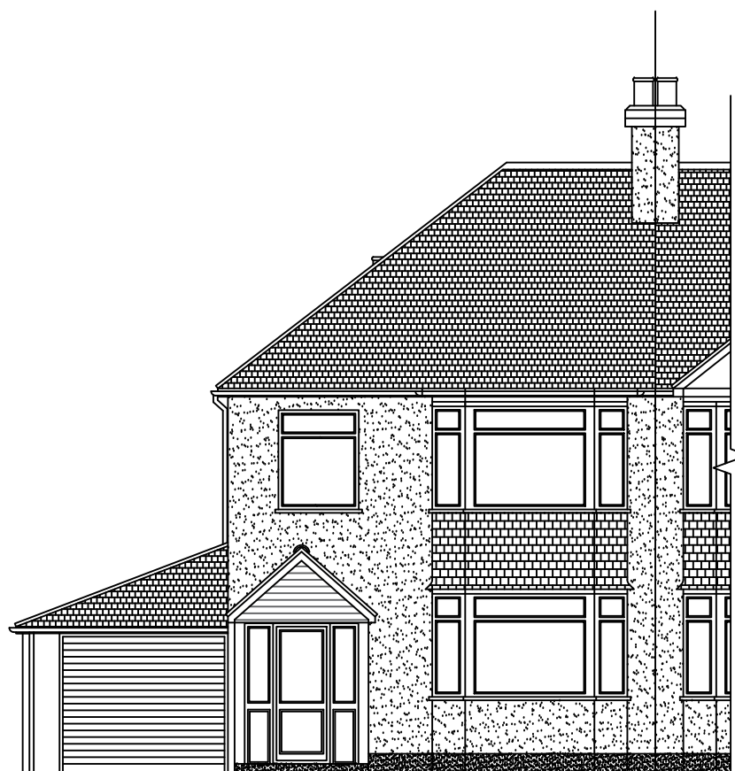
EXISTING FRONT ELEVATION NO CHANGE