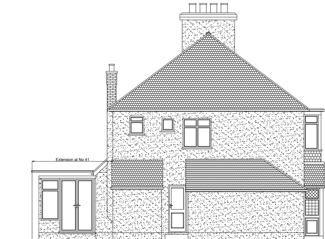
EXISTING LEFT SIDE ELEVATION