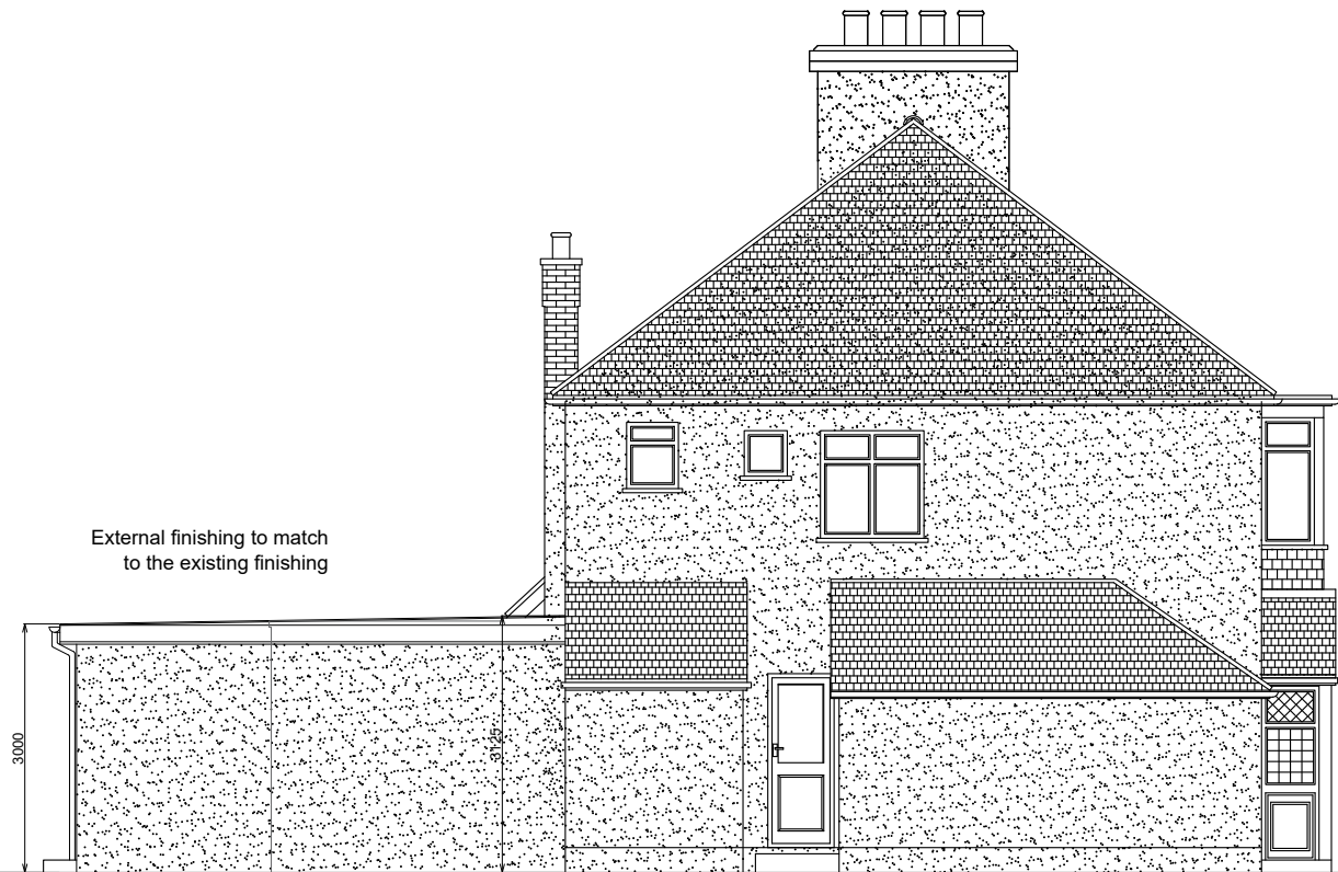
PROPOSED LEFT SIDE ELEVATION