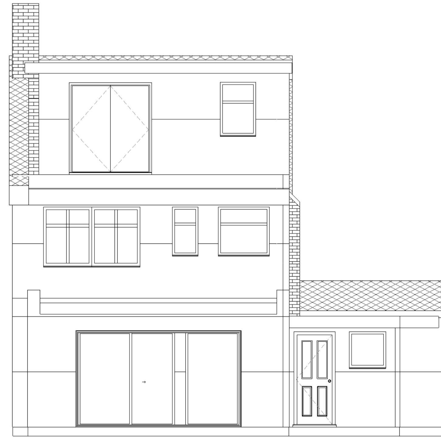
2 Existing Rear Elevation 1 : 50