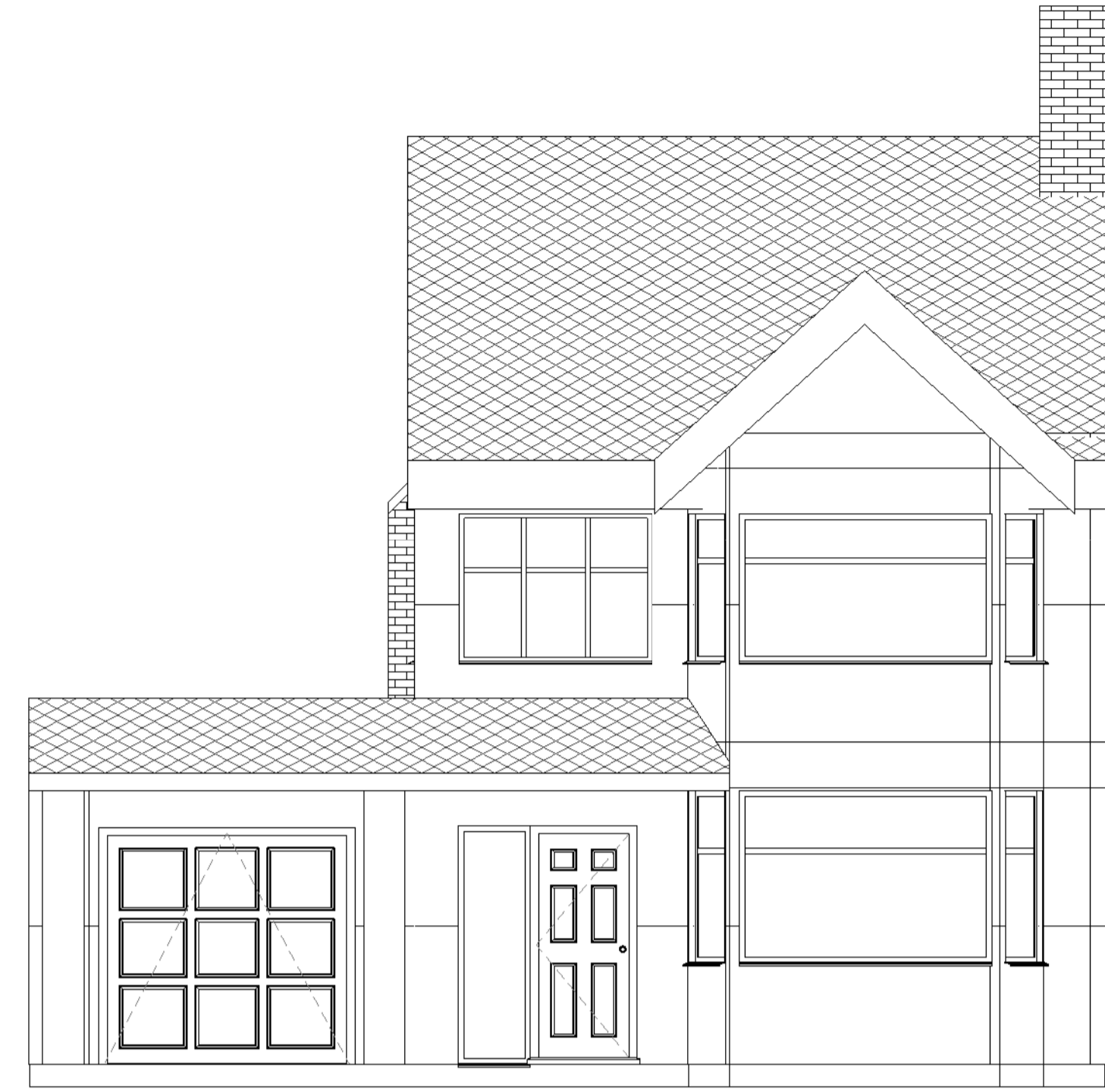
1 Existing Front Elevation 1 : 50