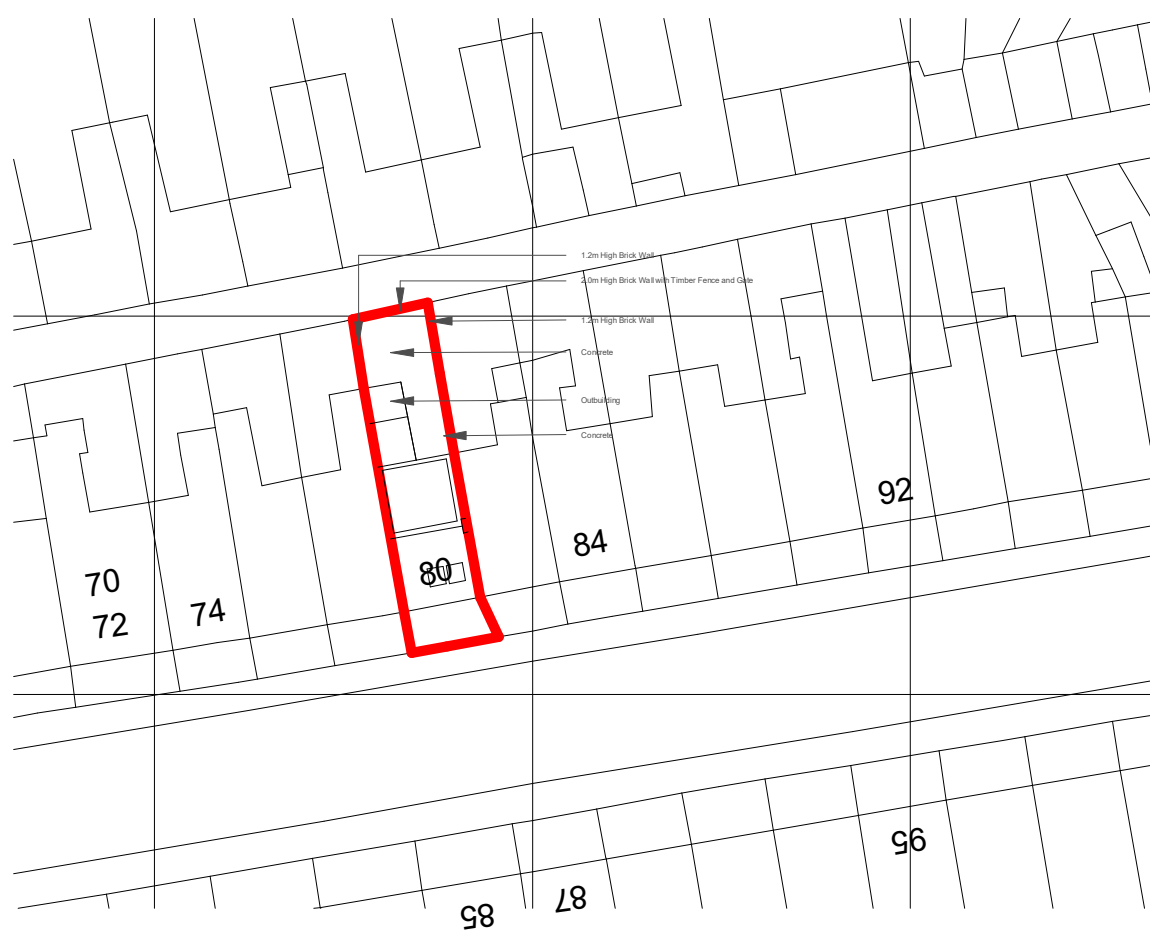
Site Plan as Existing 1 : 500