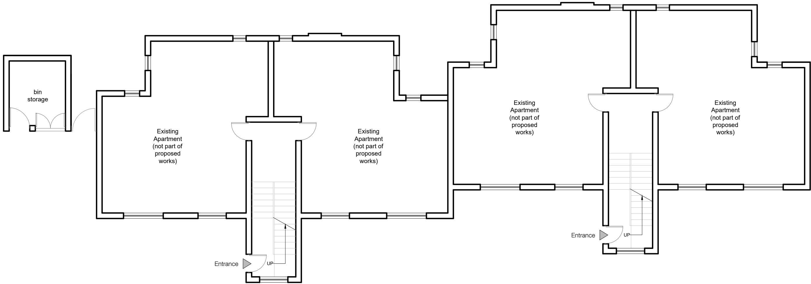
Existing Ground Floor Plan 1:100