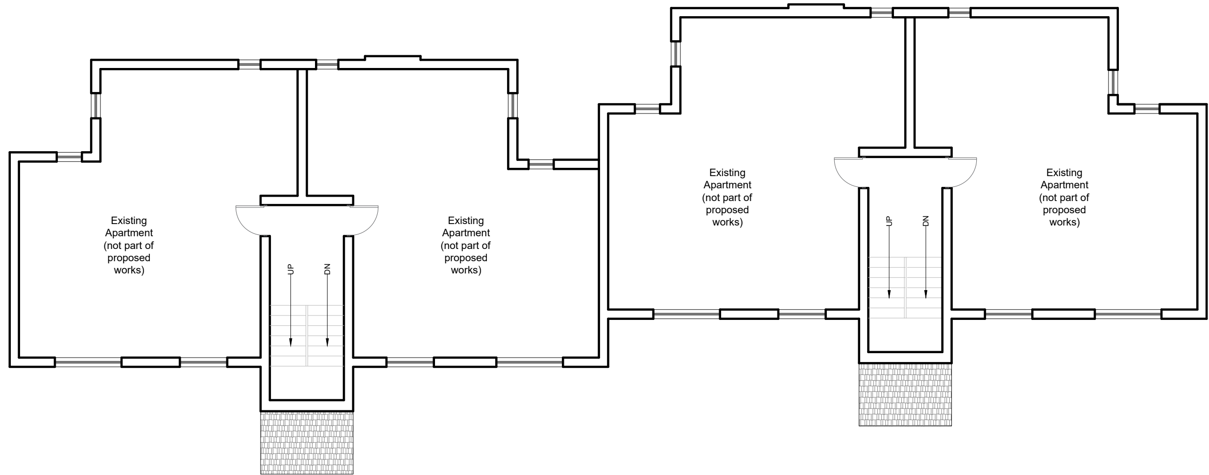
Existing First Floor Plan 1:100