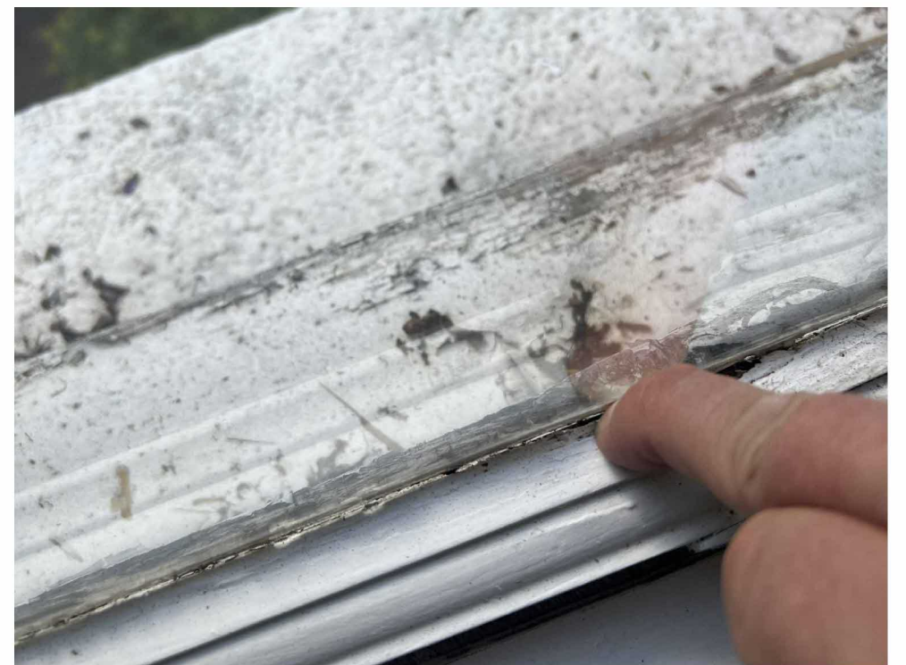
05 CONDITION EXAMPLE OF ROT IN FRAMES