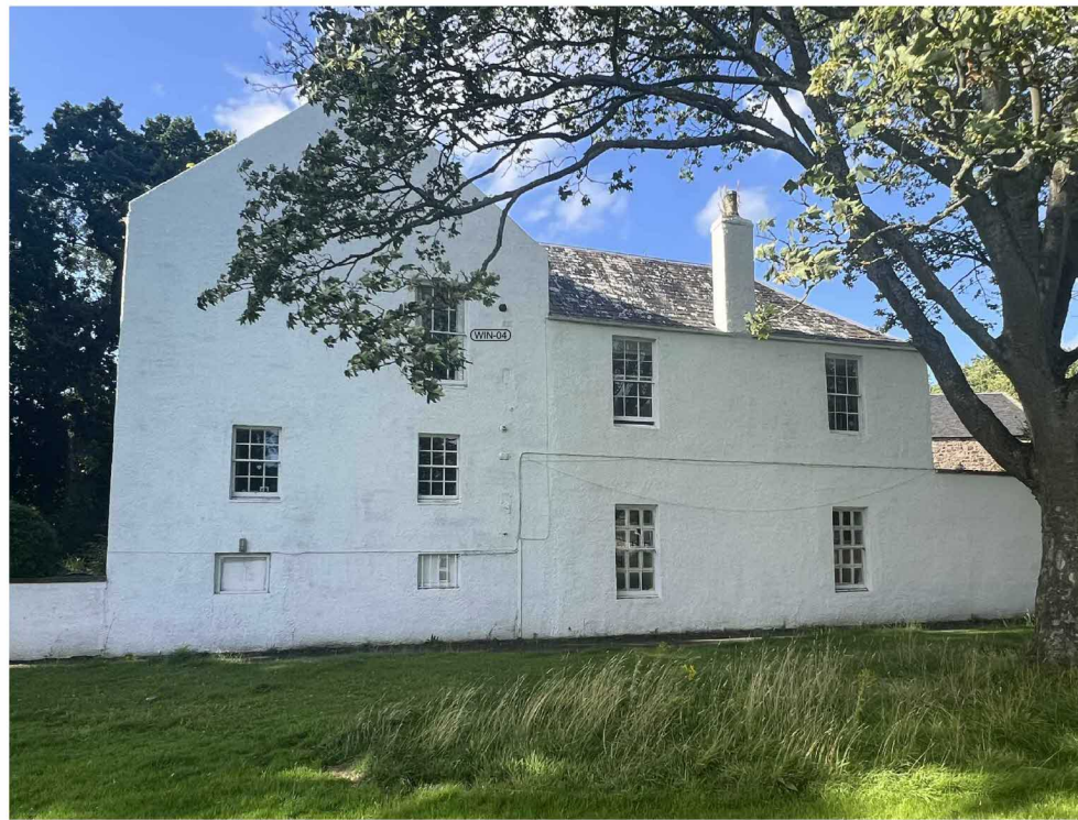
02 SOUTH ELEVATION