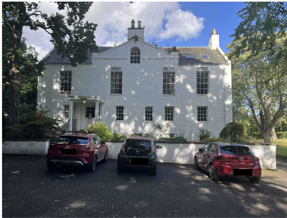
01 WEST ELEVATION