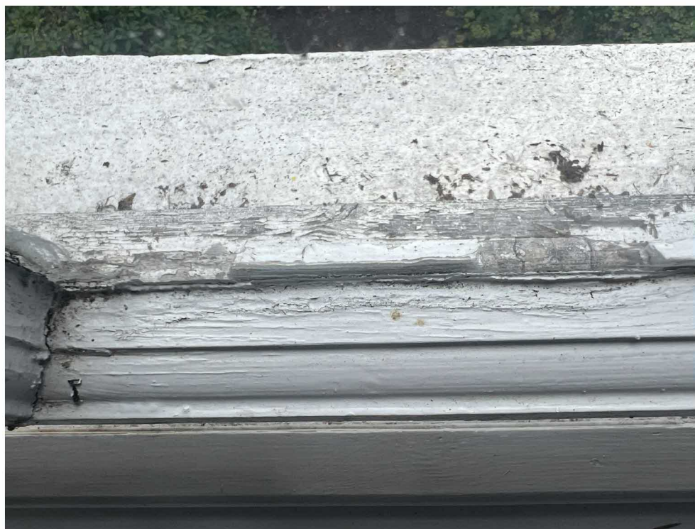
03 CONDITION EXAMPLE OF ROT IN FRAMES