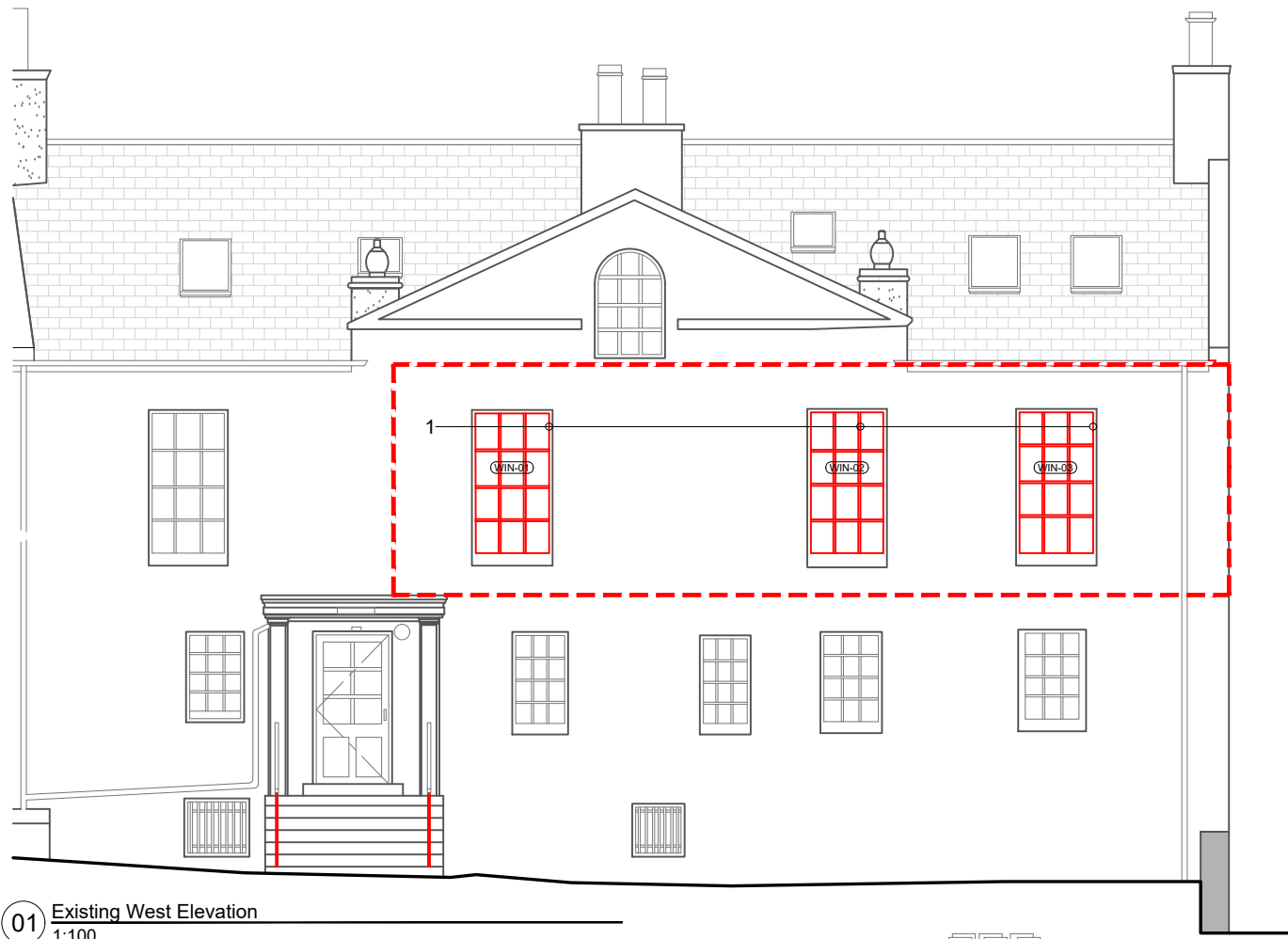
01 Existing West Elevation 1:100