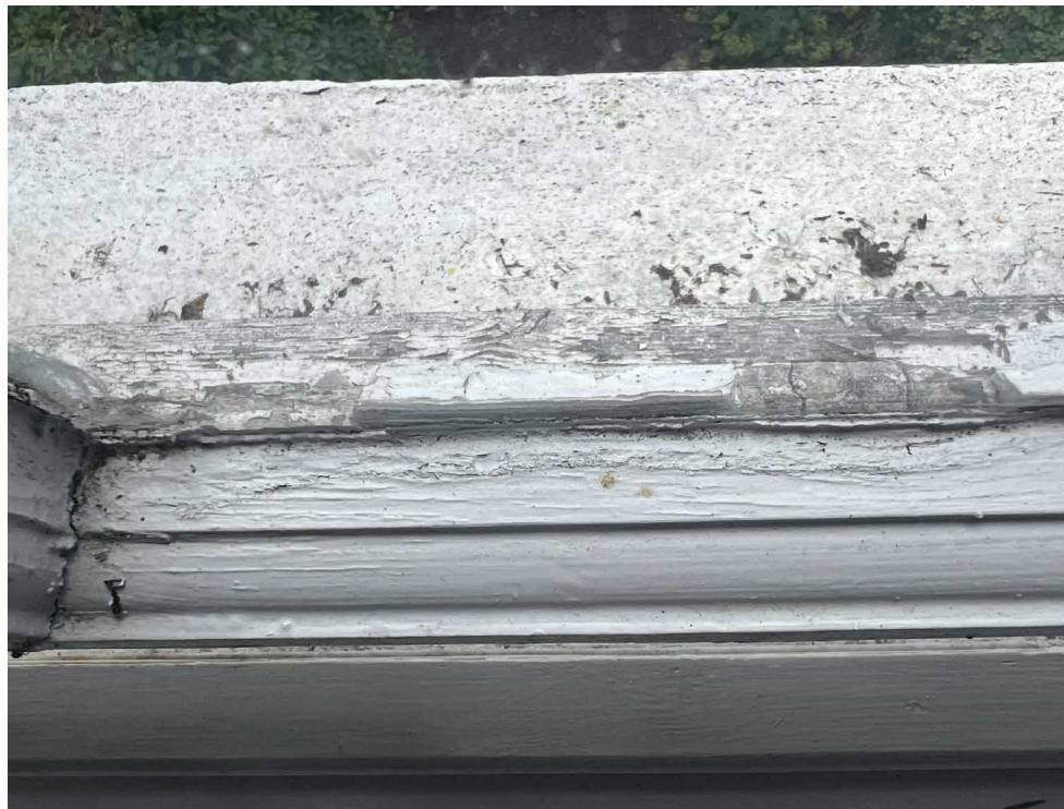
03 CONDITION EXAMPLE OF ROT IN FRAMES