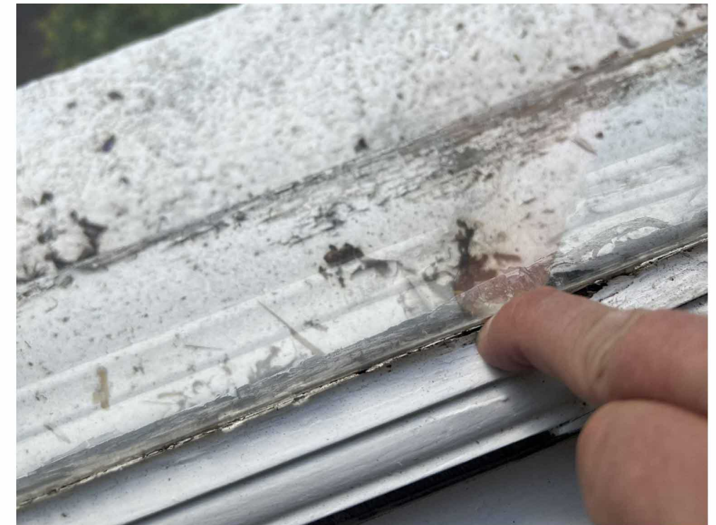
05 CONDITION EXAMPLE OF ROT IN FRAMES