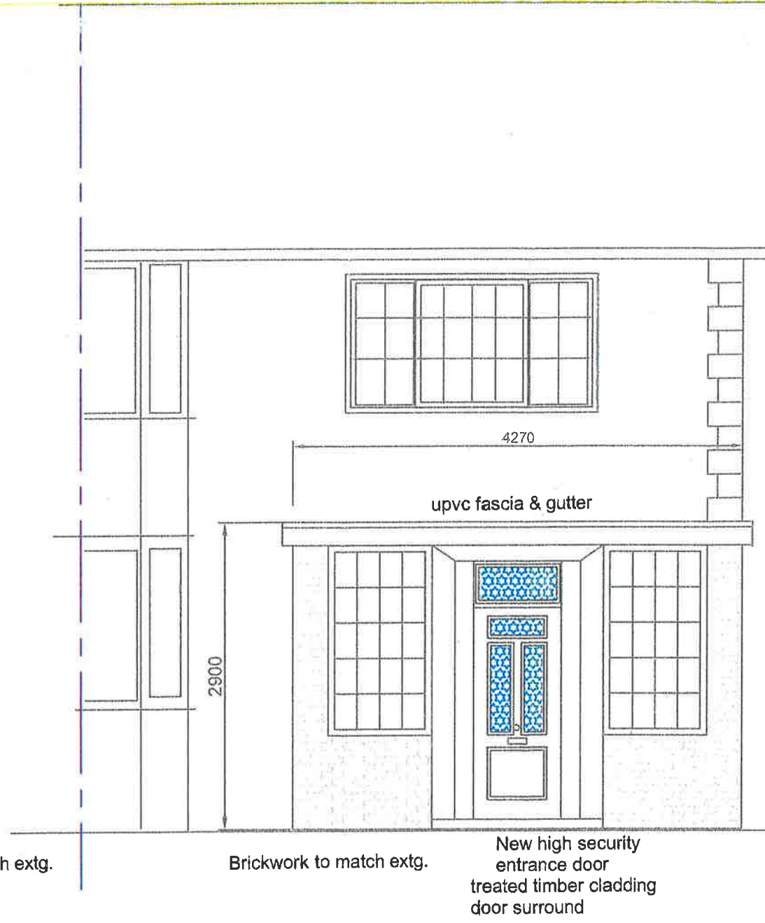
PROPOSED PART FRONT ELEVATION