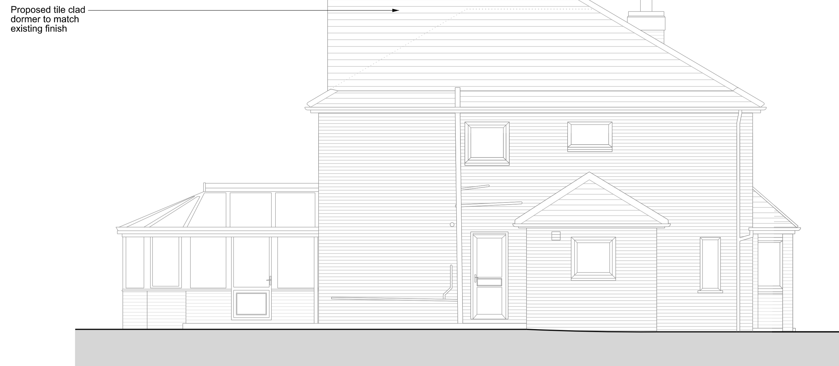
03 Side Elevation