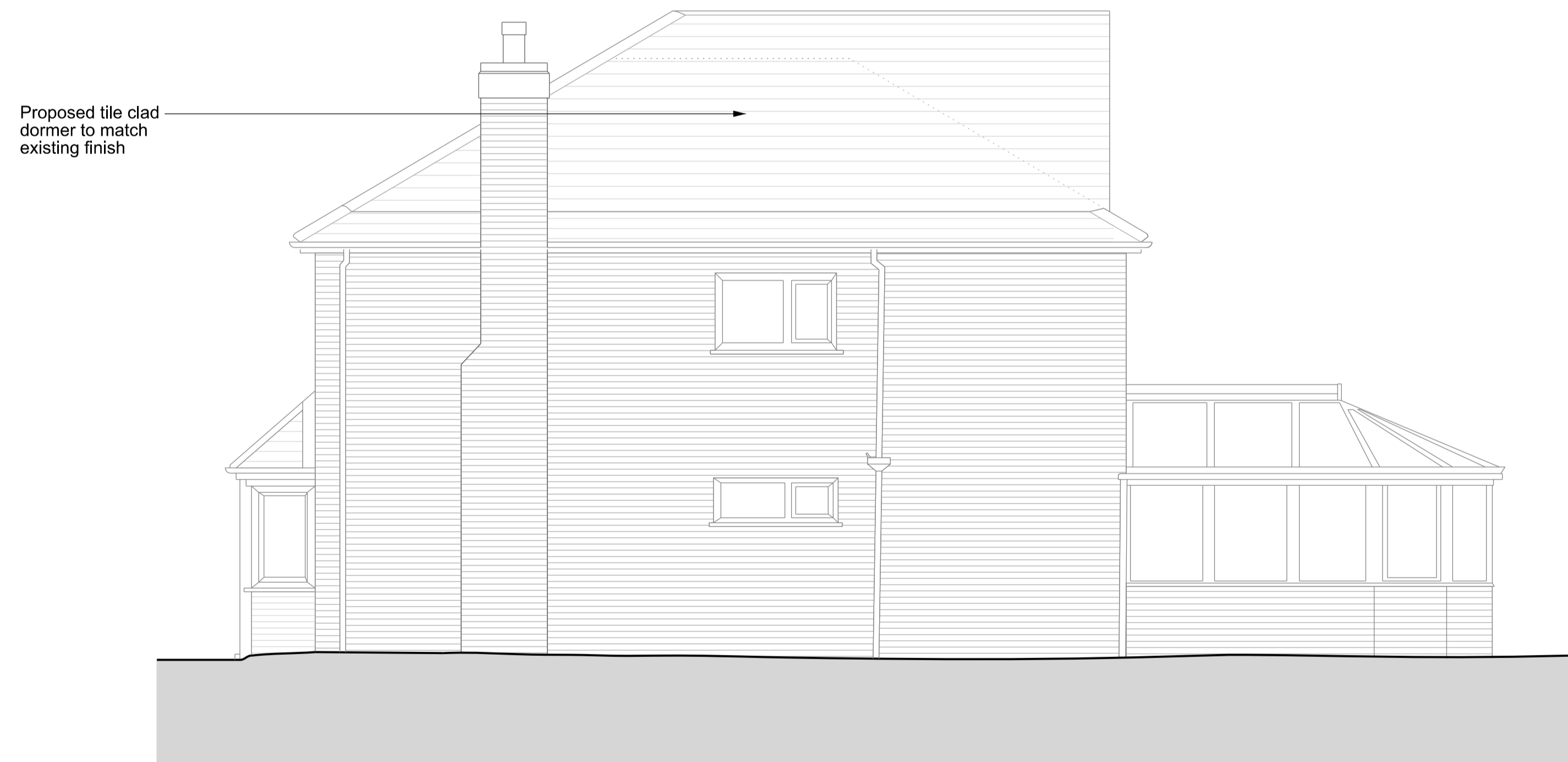
04 Side Elevation