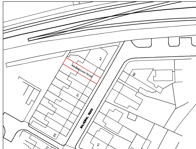
LOCATION SITE PLAN 1:1250

FOR THE OUTSTANDING RISKS PLEASE SEE "P.D'S DESIGNERS RISK ASSESSMENT REGISTER" WITHIN THE PRE-CONSTRUCTION H&S FILE.