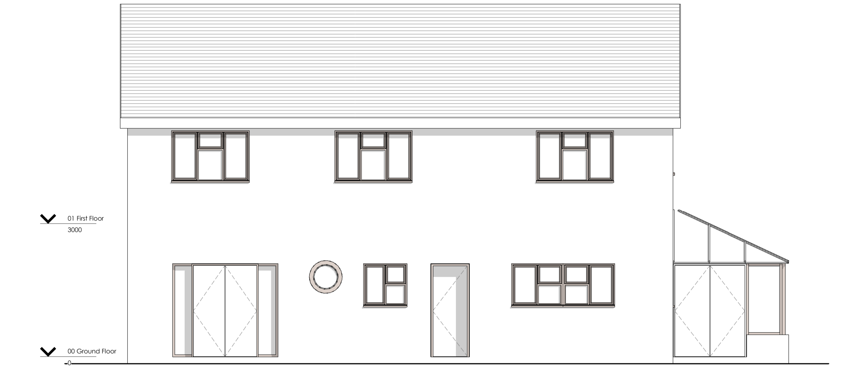
Ex Rear 1 : 50