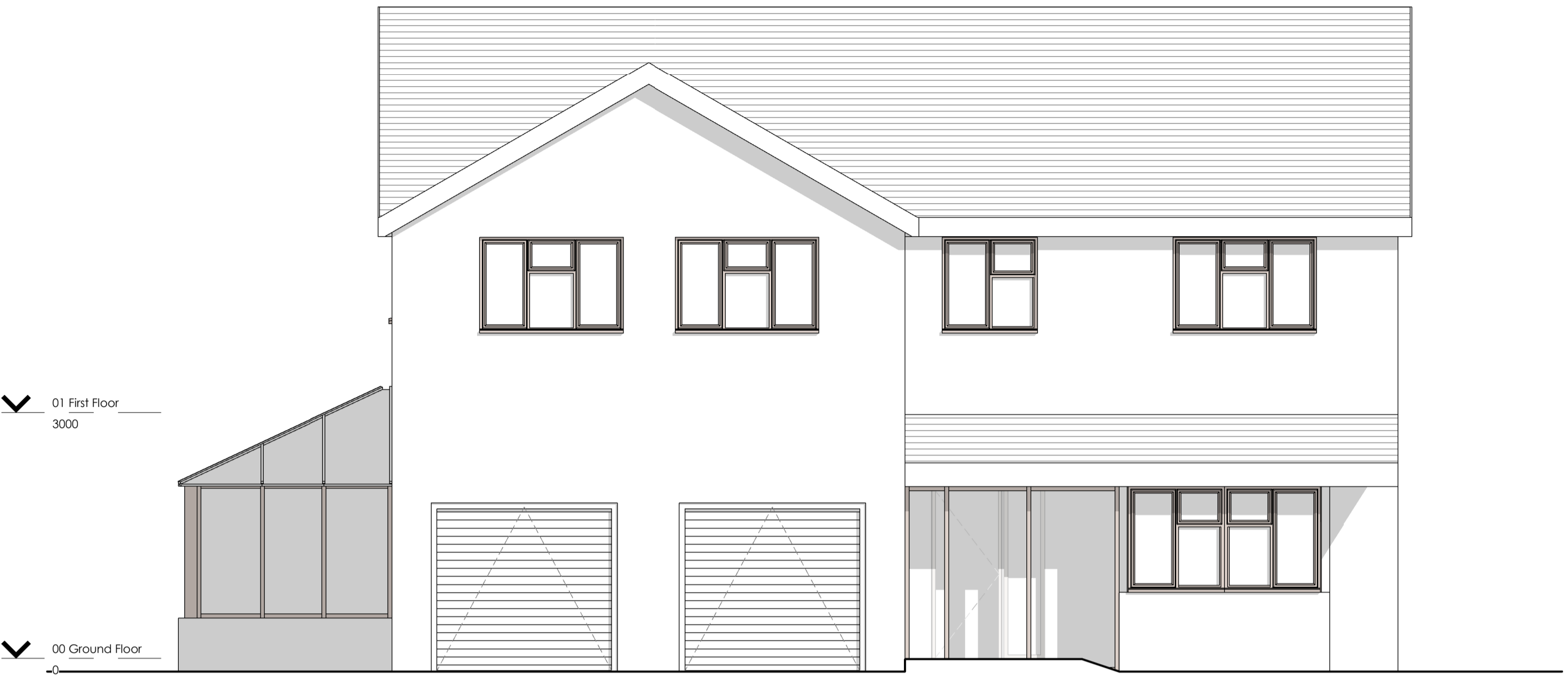
Ex Front 1 : 50