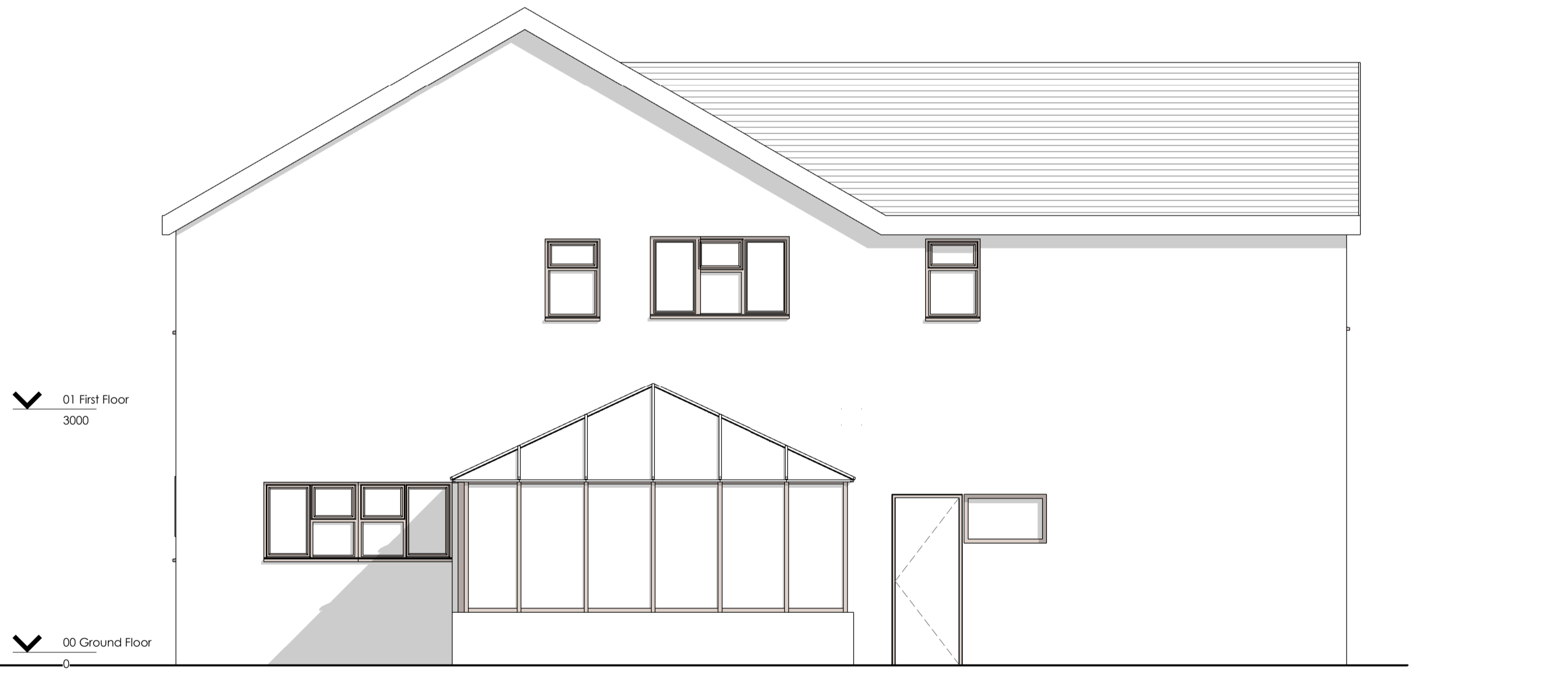
Ex Side 1 1 : 50