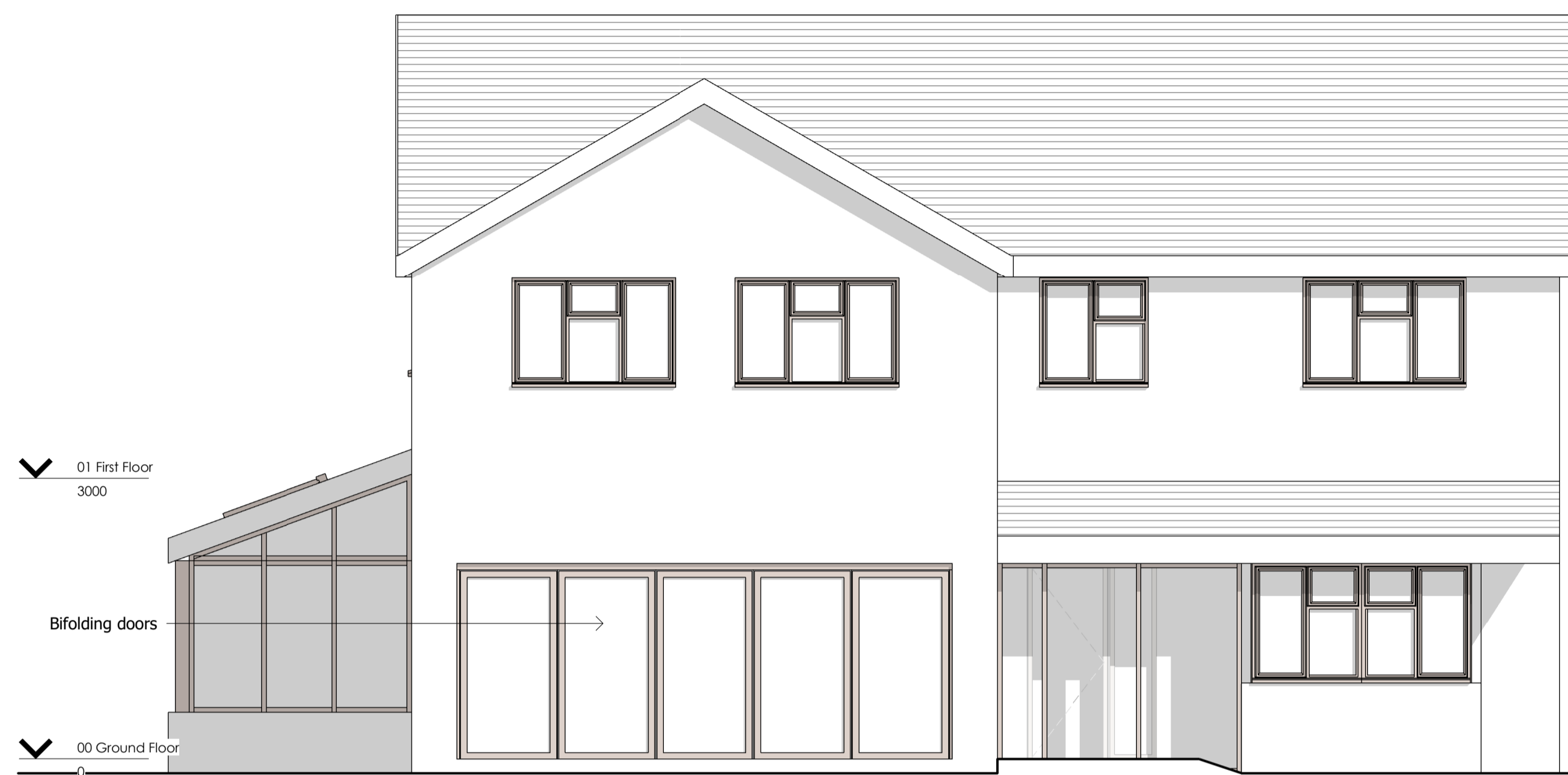
Pr Front 1 : 50