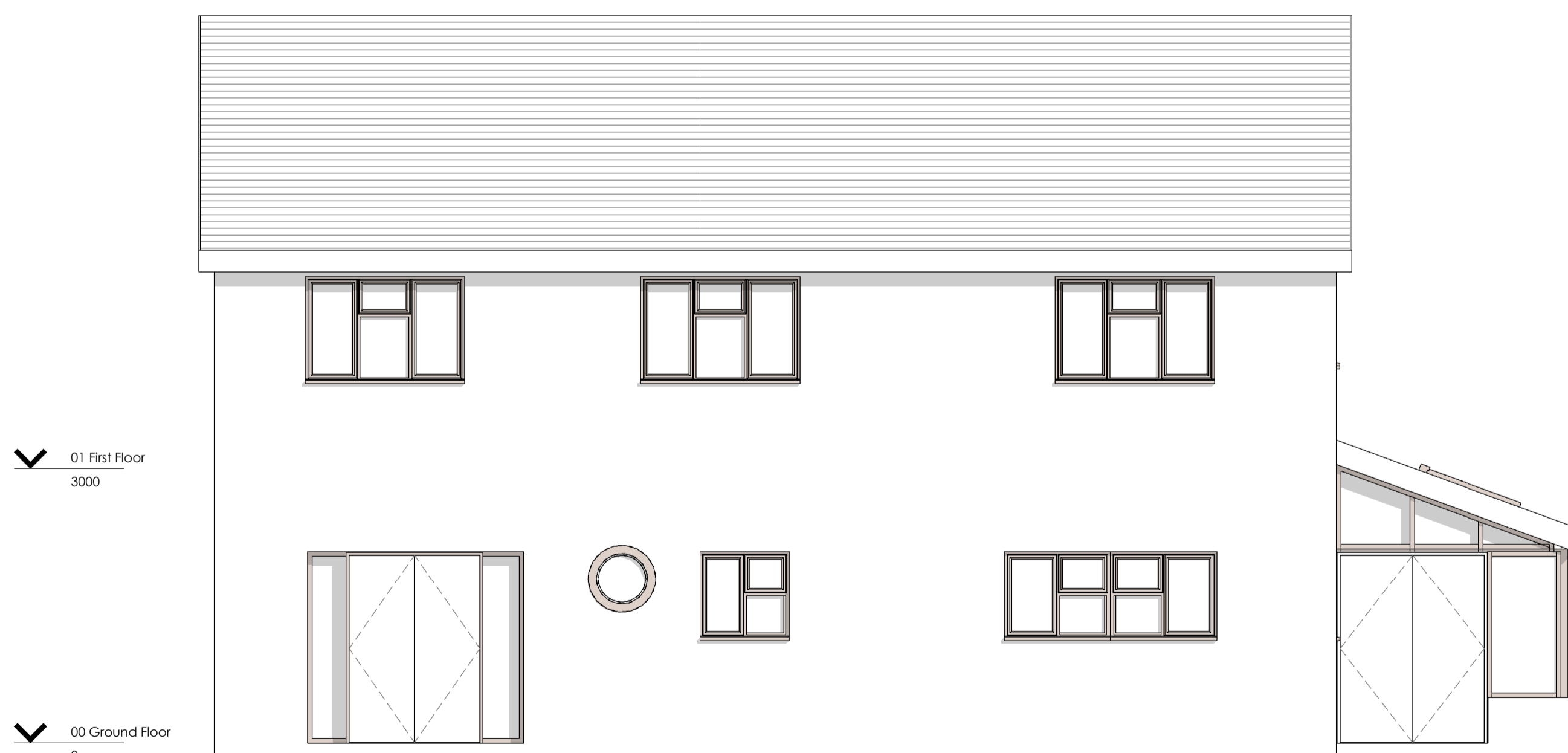
Pr Rear 1 : 50