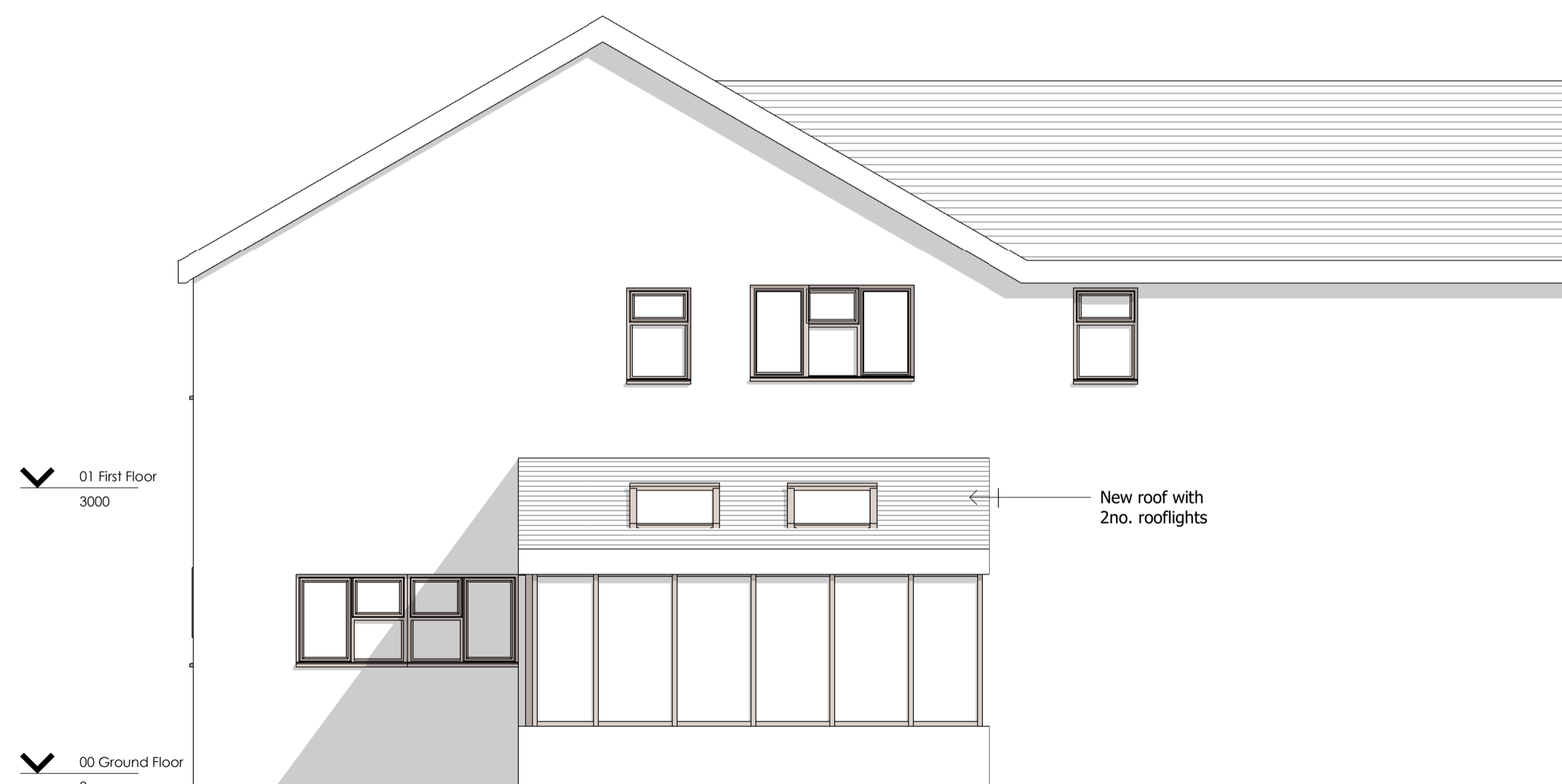
Pr Side 1 1 : 50