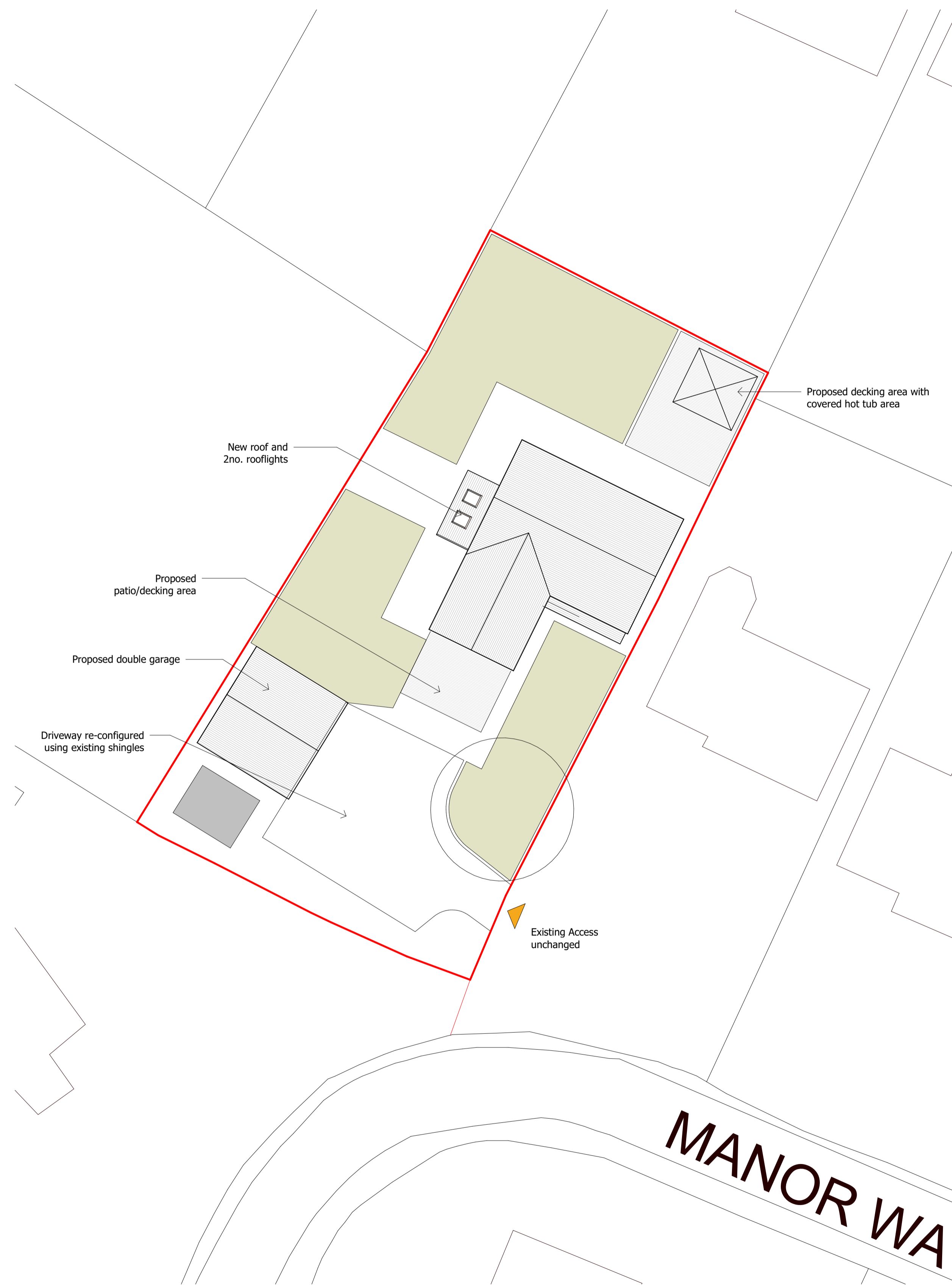
10 Proposed Site Plan 1 : 200