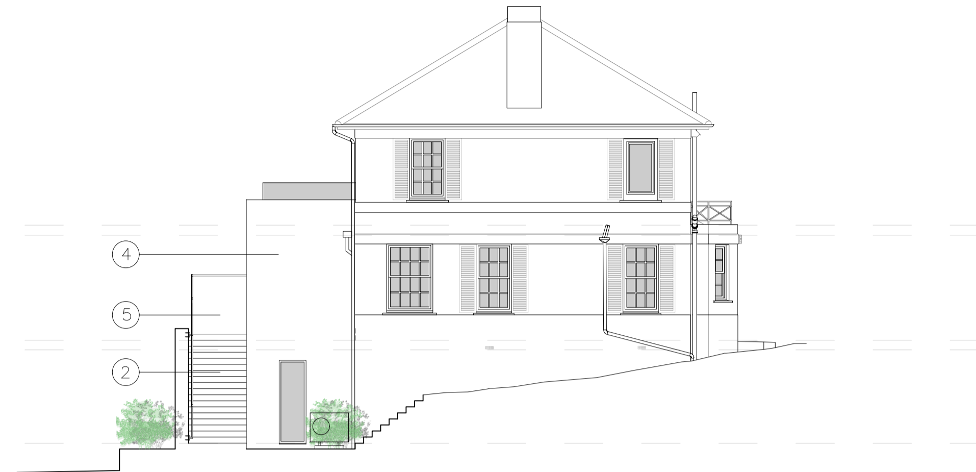
SIDE (EAST) ELEVATION - AS PROPOSED SCALE @ 1:100 ON AN A1 SHEET