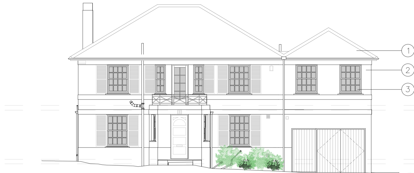
FRONT (NORTH) ELEVATION - AS PROPOSED SCALE @ 1:100 ON AN A1 SHEET