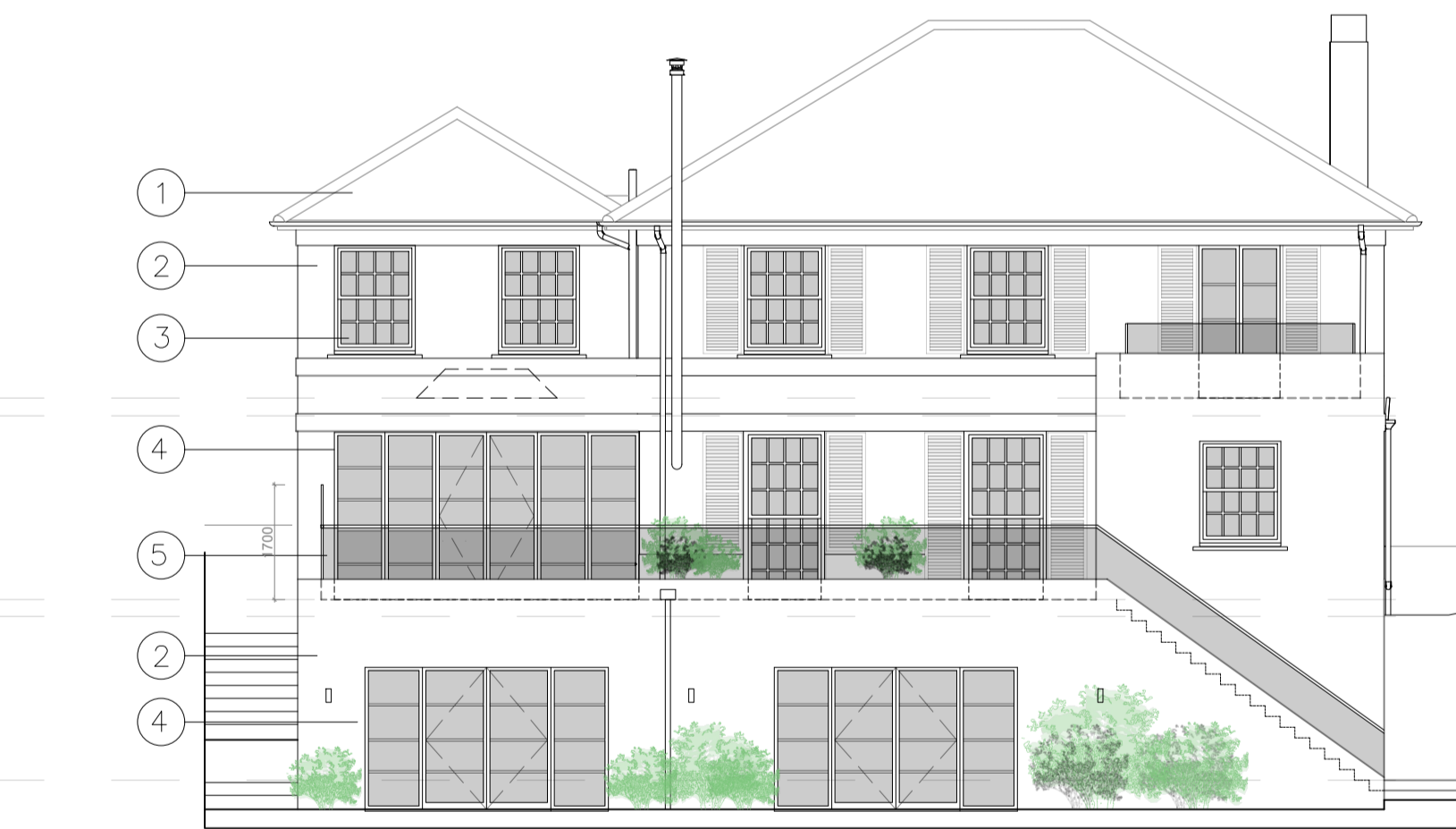
REAR (SOUTH) ELEVATION - AS PROPOSED SCALE @ 1:100 ON AN A1 SHEET