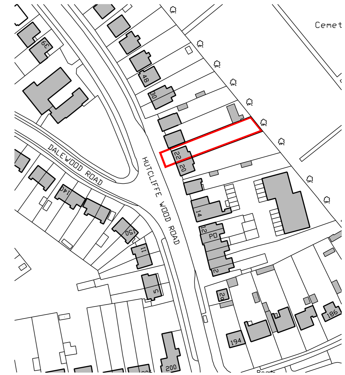
location plan scale 1:1250