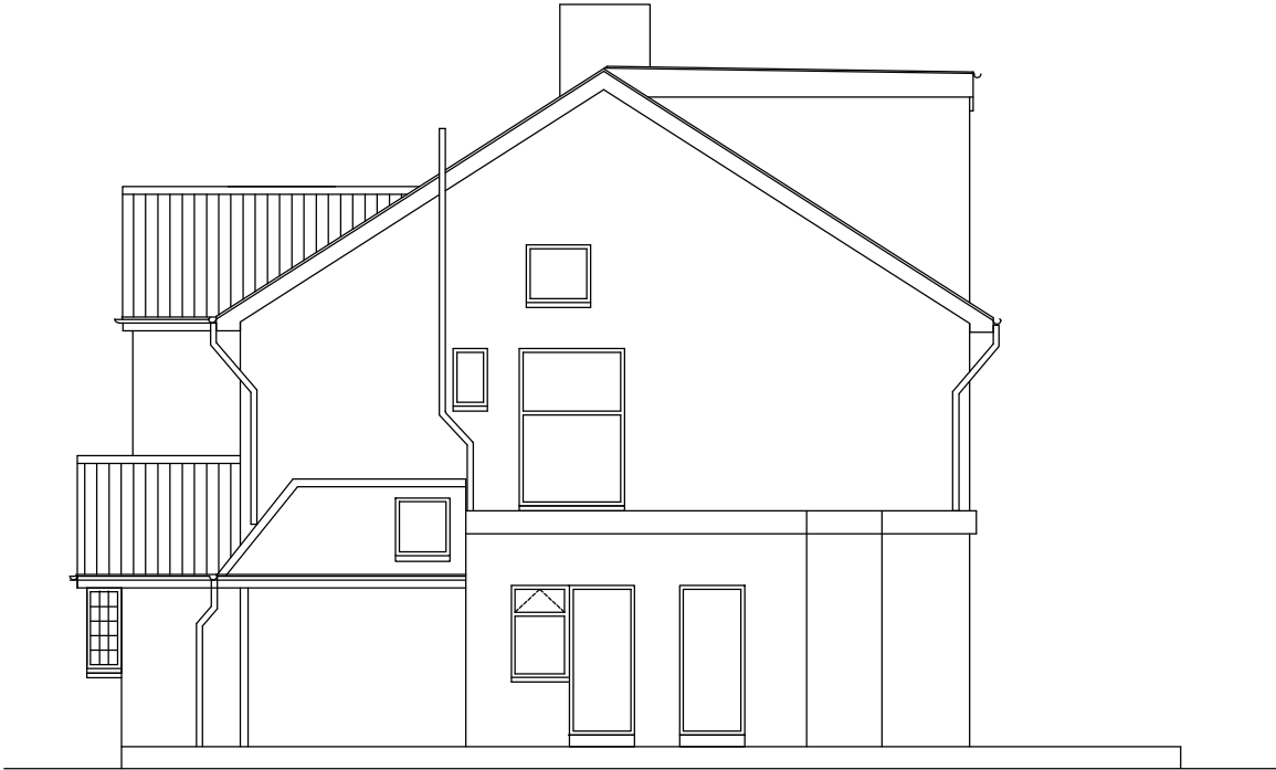
SIDE ELEVATION no.50