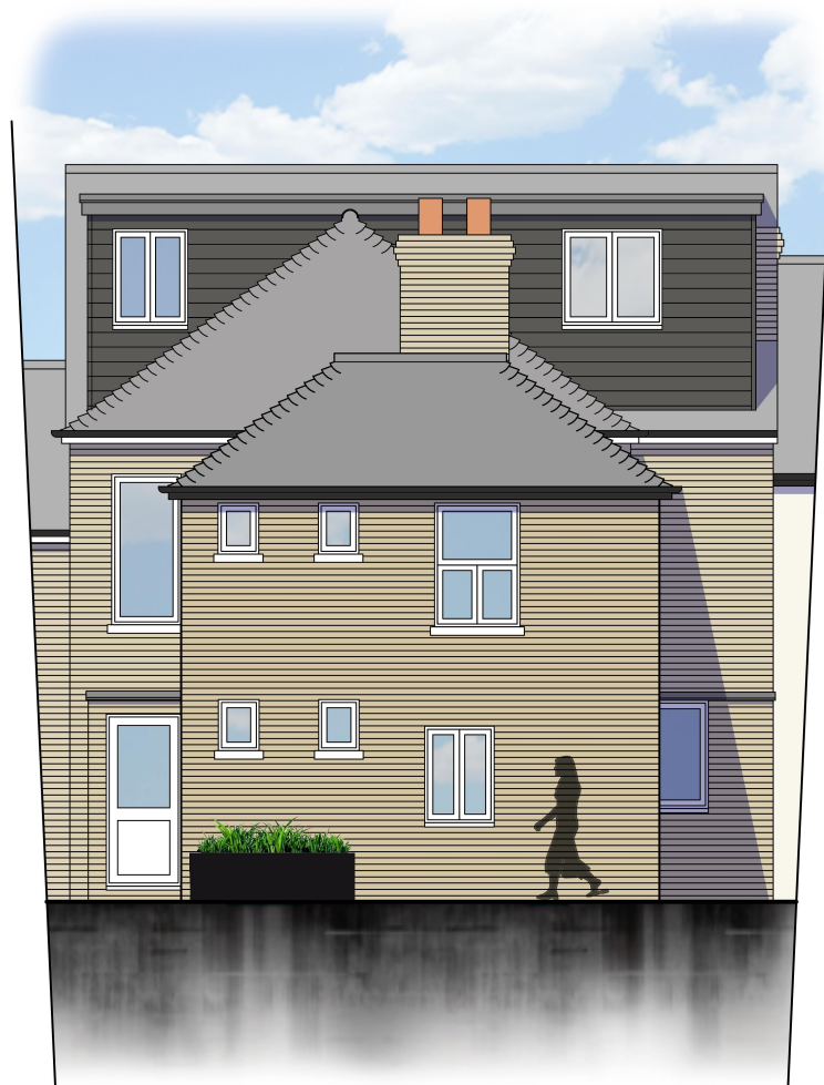
rear - north west