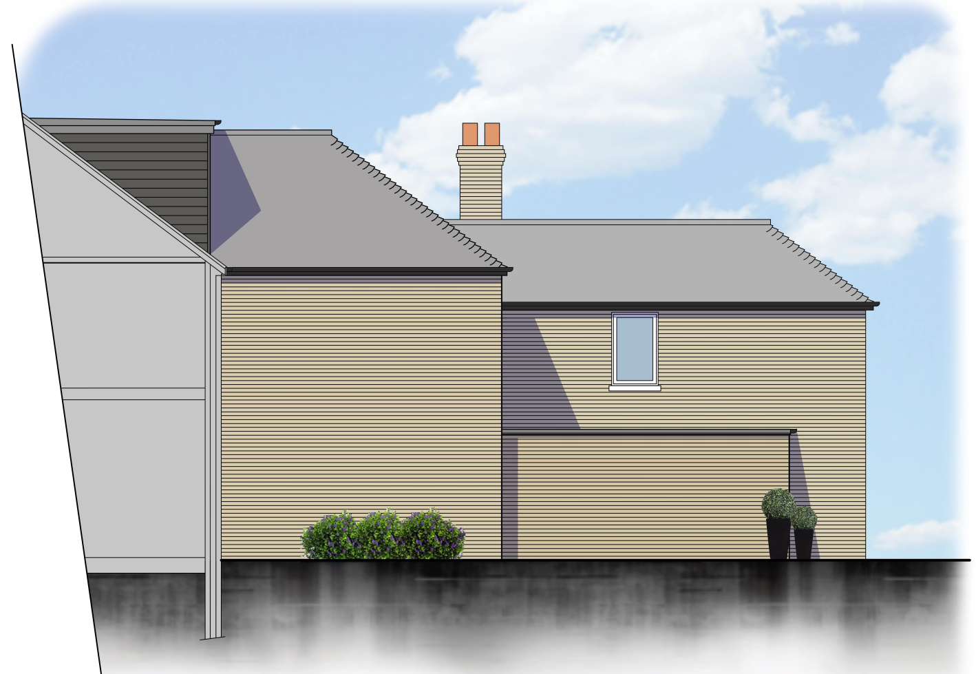
side - north east