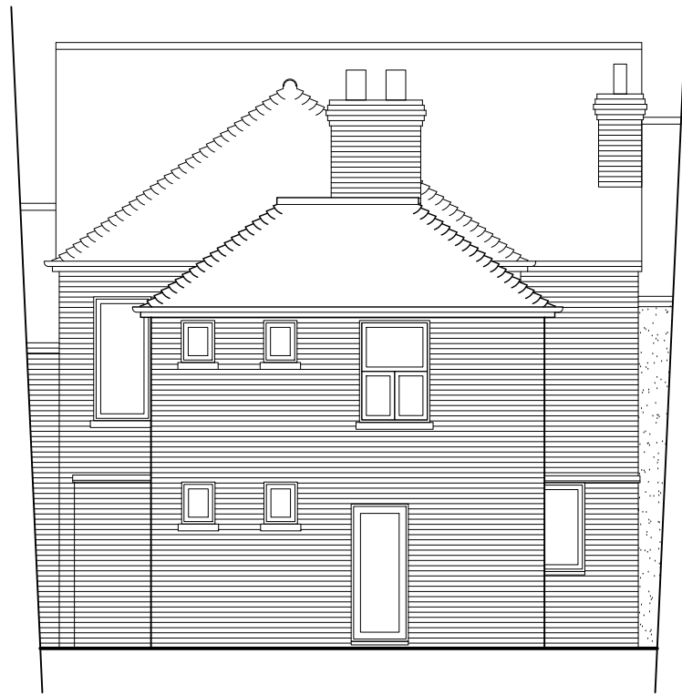
rear - north west