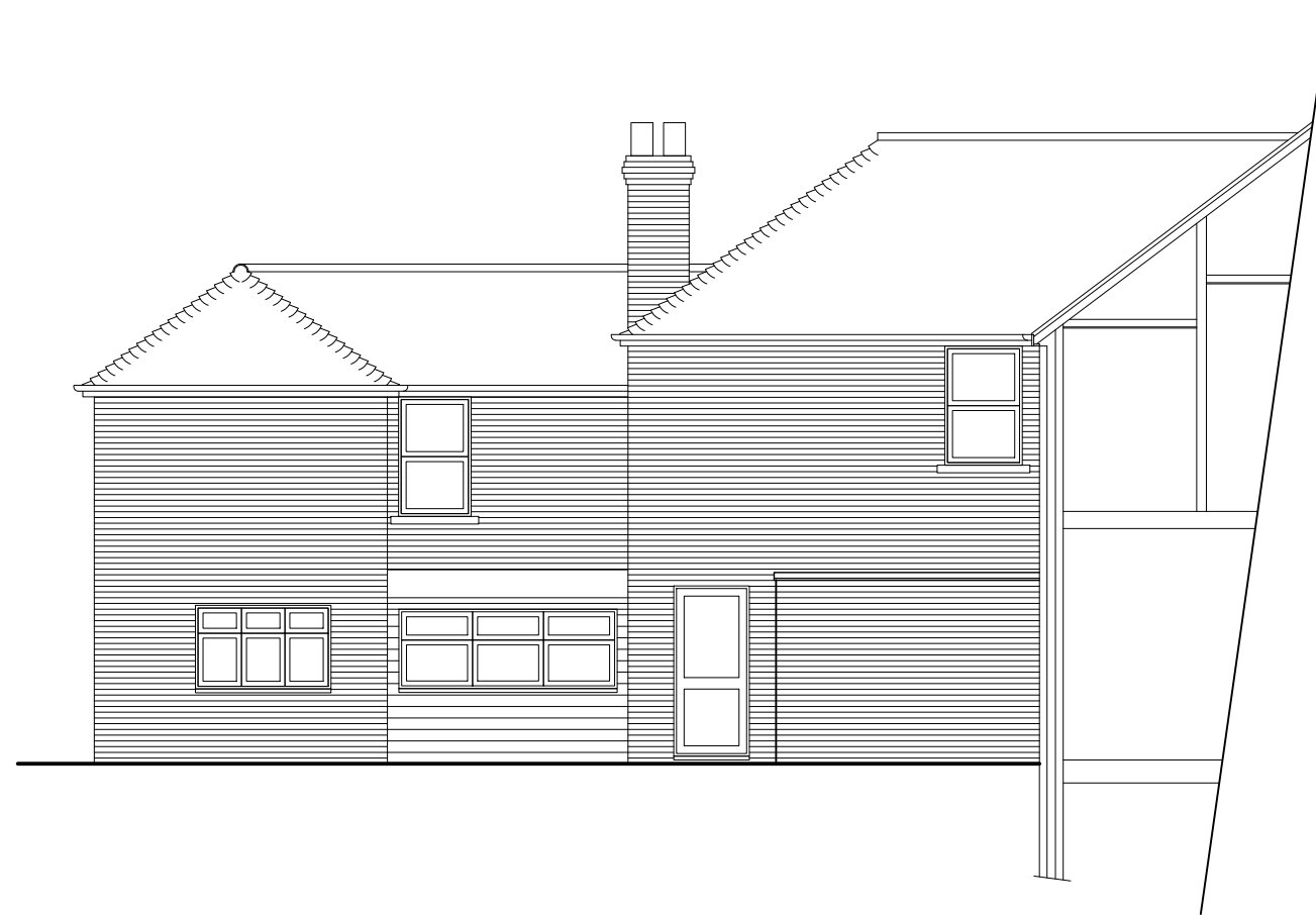
side - south west