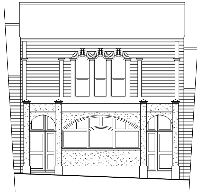
front - south east