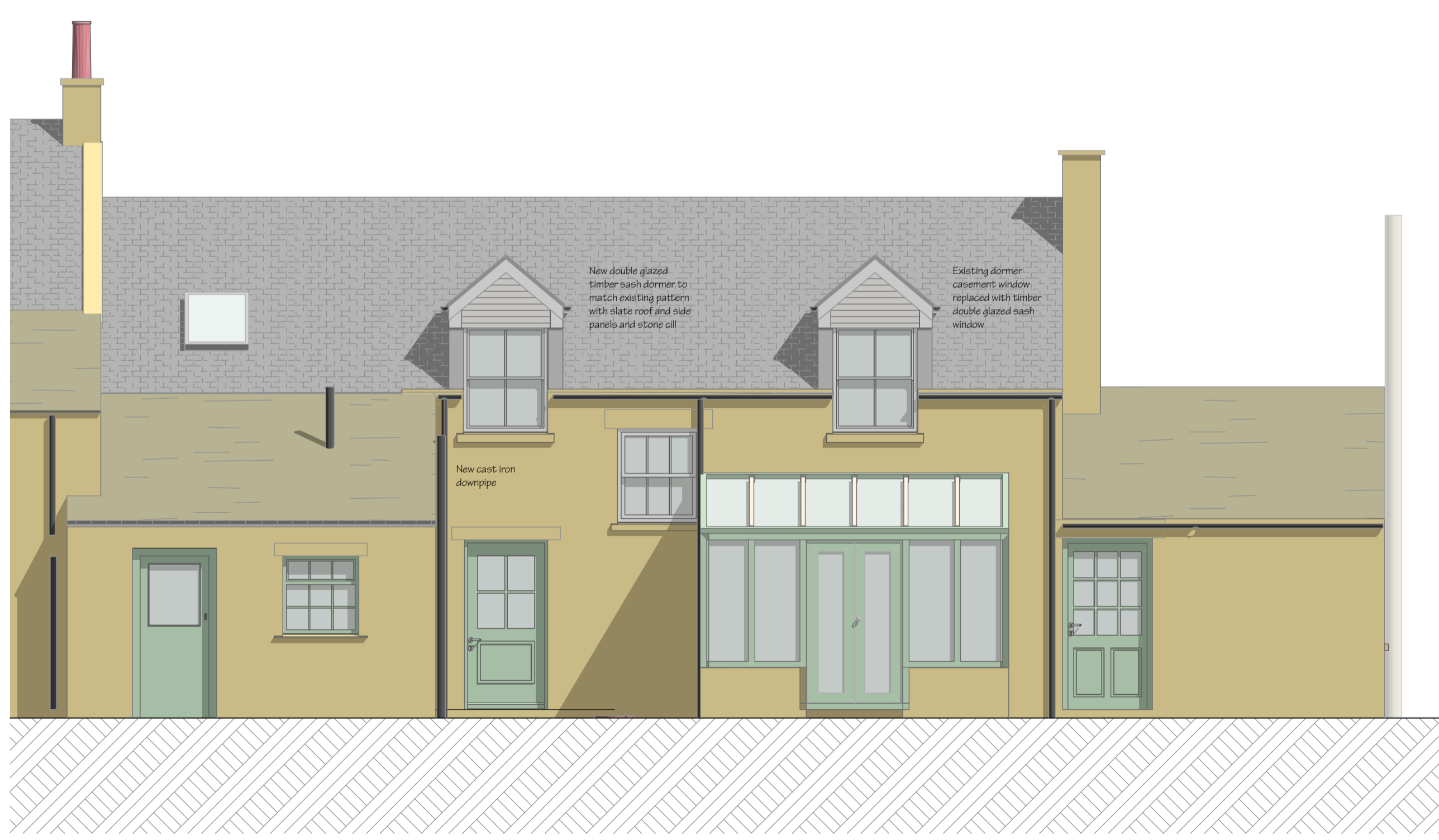
1 BUTTS SOUTH ELEVATION 1:50