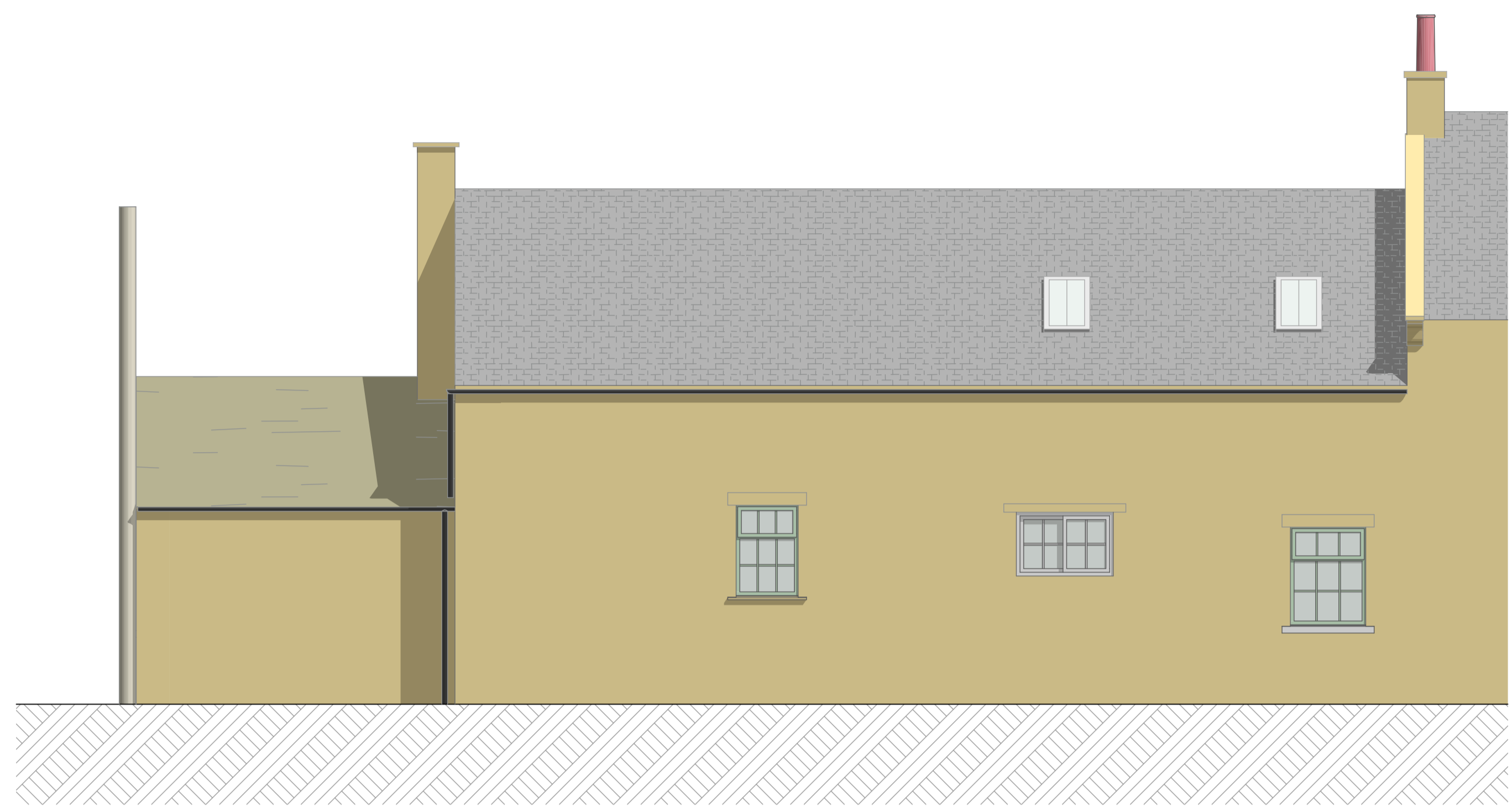
2 BUTTS NORTH ELEVATION 1:50