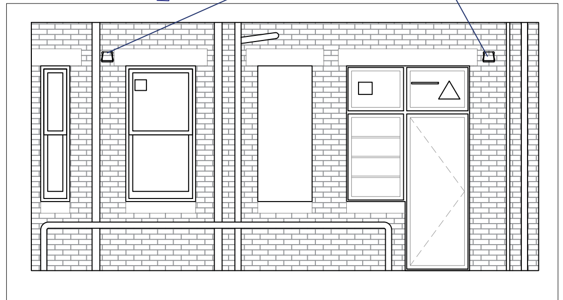
PROPOSED NORTH FACING LIGHTWELL ELEVATION 1/50