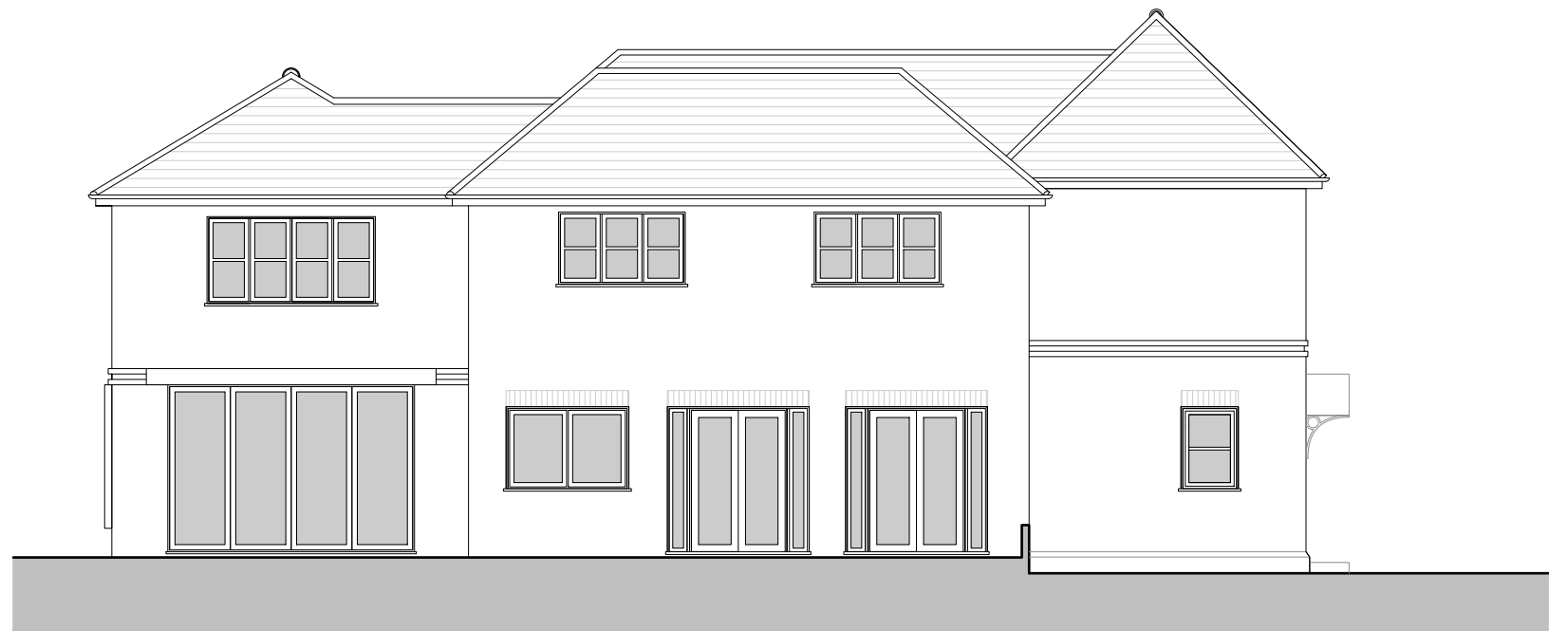
Side Elevation - 1:100