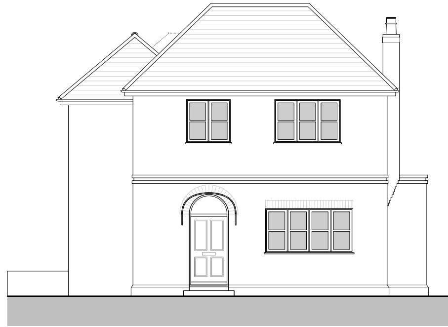
Front Elevation - 1:100