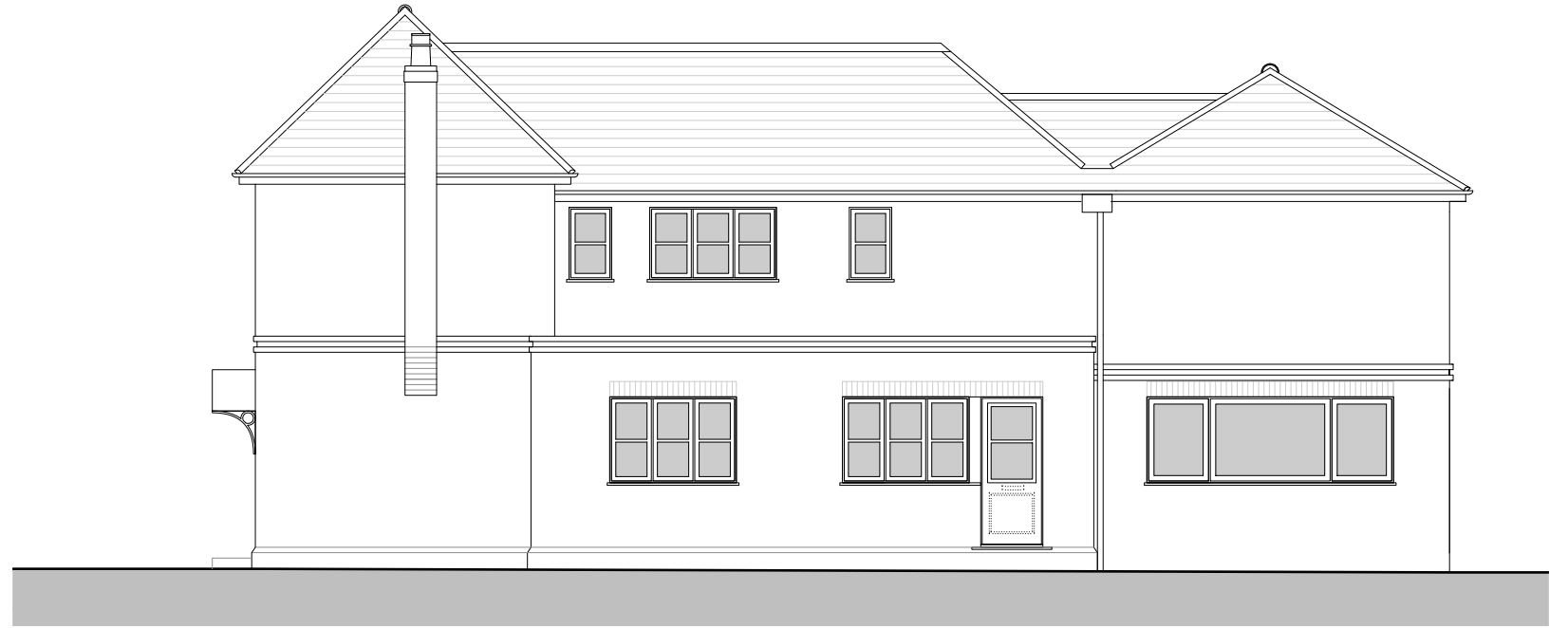
Side Elevation - 1:100