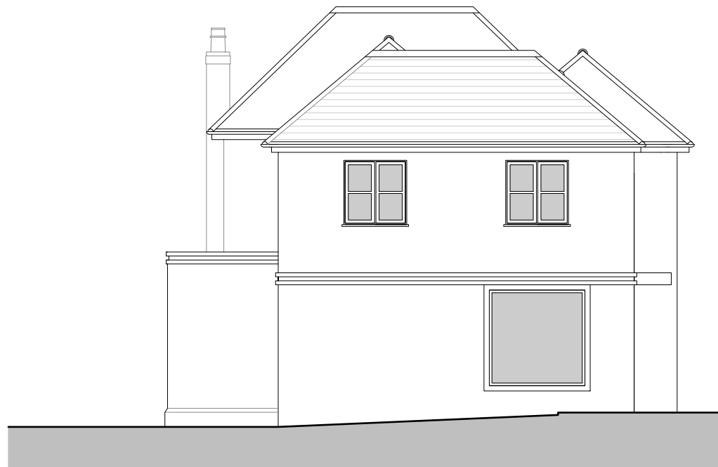
Rear Elevation - 1:100