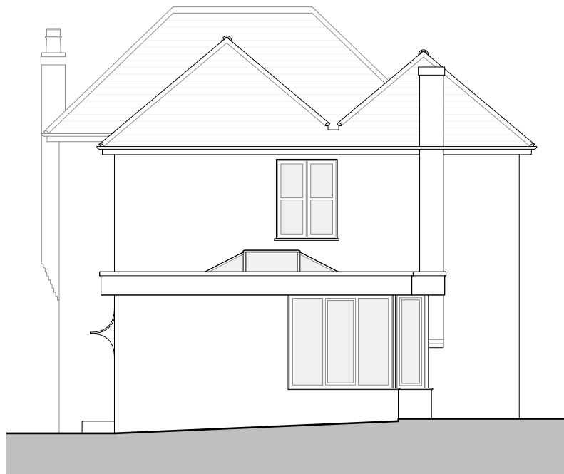
Rear Elevation - 1:100