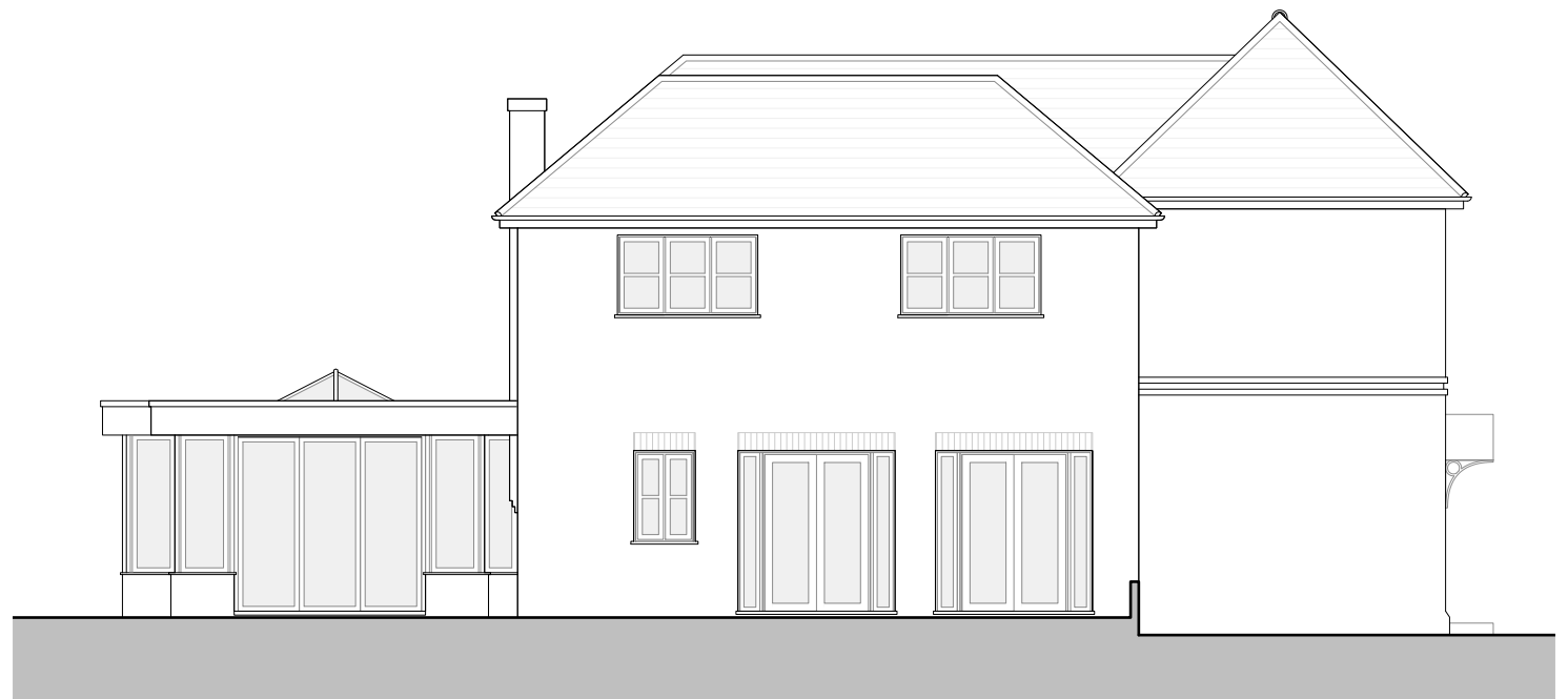
Side Elevation - 1:100