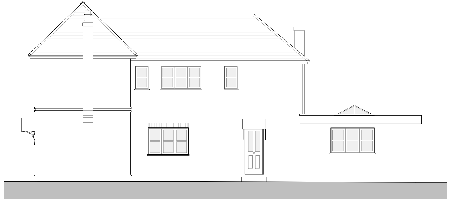
Side Elevation - 1:100