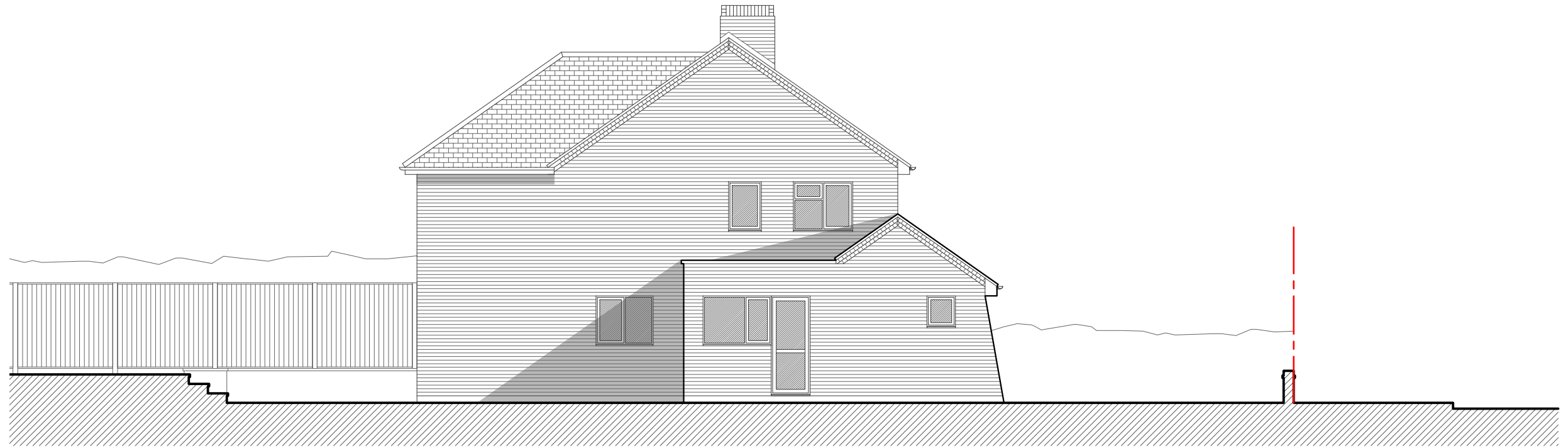
existing drawing NORTH WEST ELEVATION