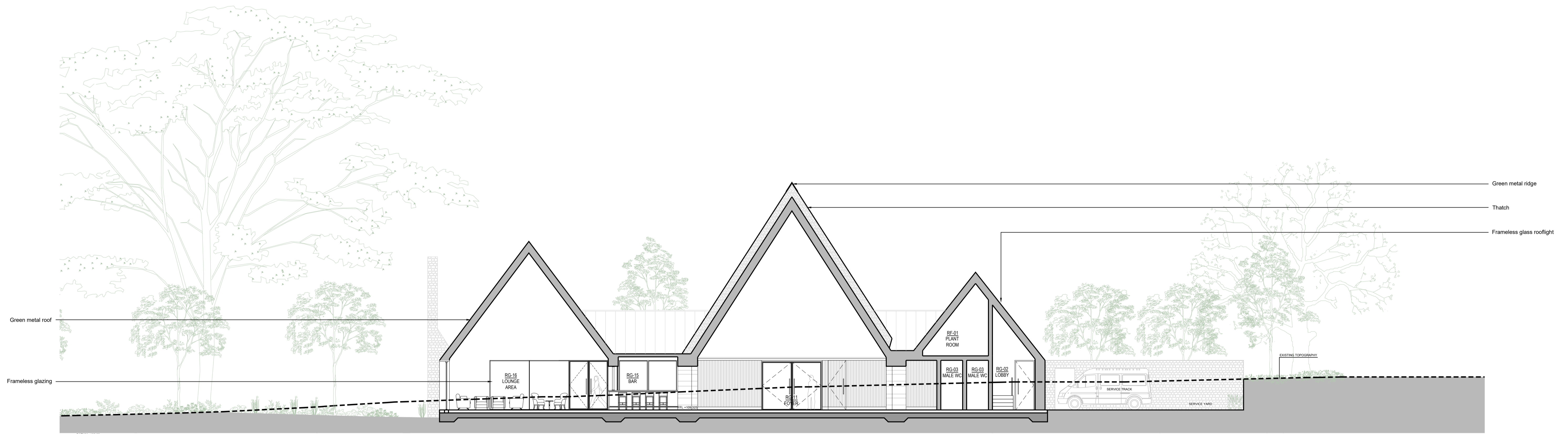
01 Transversal Section RR320 Section