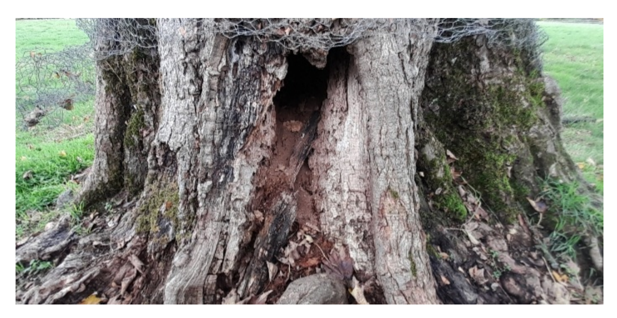
Signs of historic repeated browsing evident from iterative basal scaring beneath the attempt of fixing chicken wire over the damage. (Lifted up and away here for the illustration of this photograph)