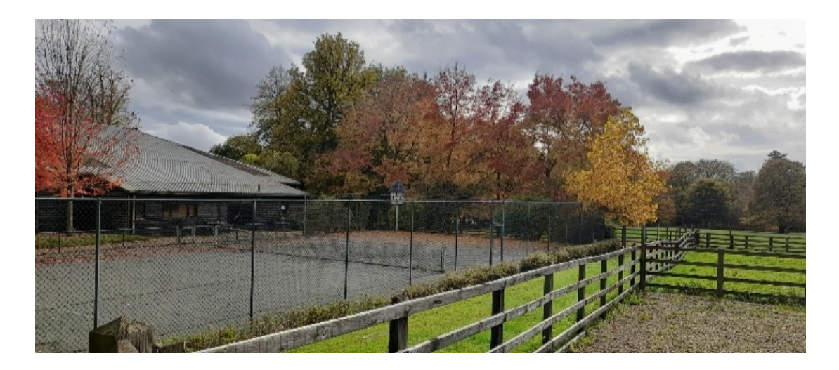
Groups of young ornamental ash and maples form collective landscape value worthy of retention, only if they can be positively designed into and incorporated into the sites future development plans

Solitary Limes 2334 and 2333 seen here on the left as a remnant avenue north of the existing ménage. These trees form an existing linear habitat of mixed tree species and age class, running east to west as a connective wildlife corridor, that would benefit from low level enrichment planting of native shrubs within its established Root Protection Area, if it is chosen to be preserved.