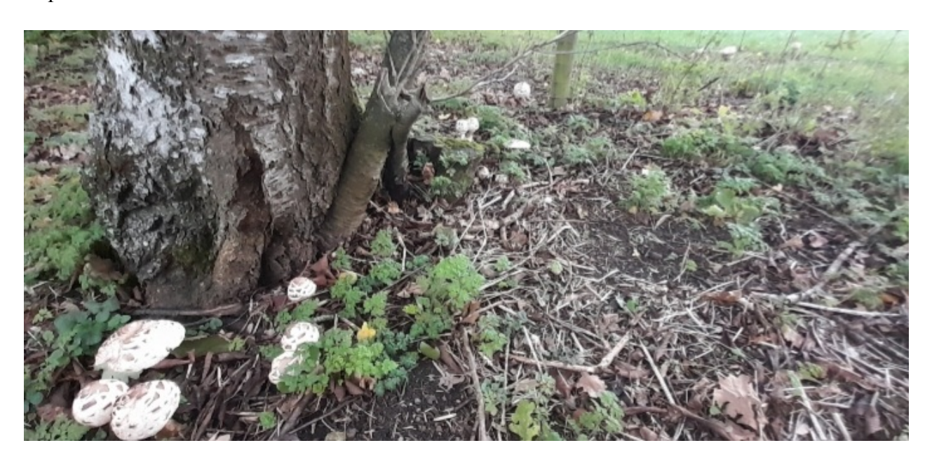
4.4 Within the locations where undisturbed grassland surrounding these trees has been excluded from repeated mowing a complexity of fungal networks can be found, often going unnoticed as a unique asset for the promotion of specialist guilds of ecological interactions.

Specifically within the narrow grouped shelter belt planting, running from the north of the ménage to the far west side of the site, by the historic pump houses, this is a fenced off area that has been excluded from historic sheep and horse browsing and has subsequently been allowed to establish the beginnings of an understory, including scrub field maples, hazel, hawthorn and holly along with the retention of fallen dead wood and a consistent natural build up of an undisturbed natural herb layer, as pictured below.