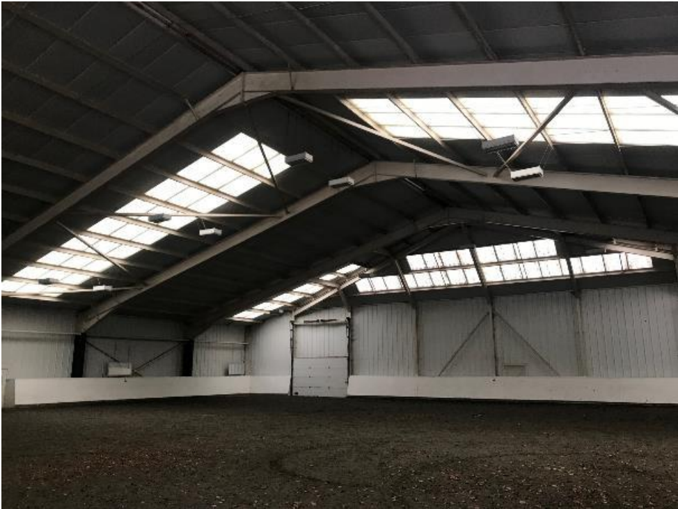
Photograph 14. The Grounds Building.