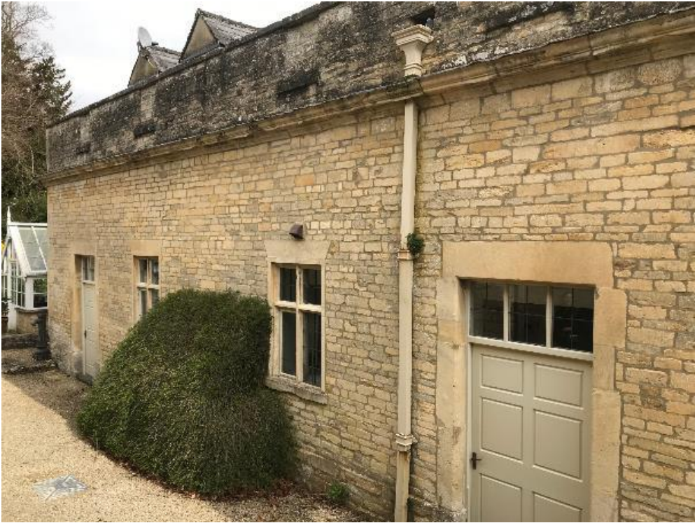
Photograph 12. The Indoor Horse Arena.