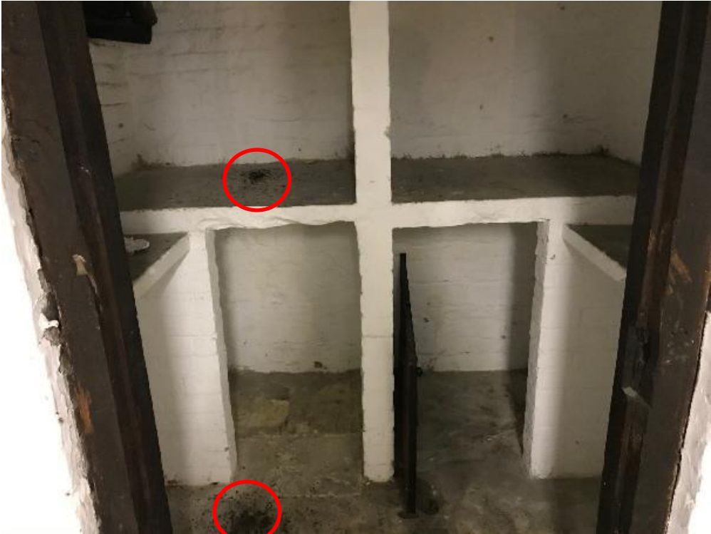
Photograph 6. Area below the Cellar stairs with lesser horseshoe droppings.