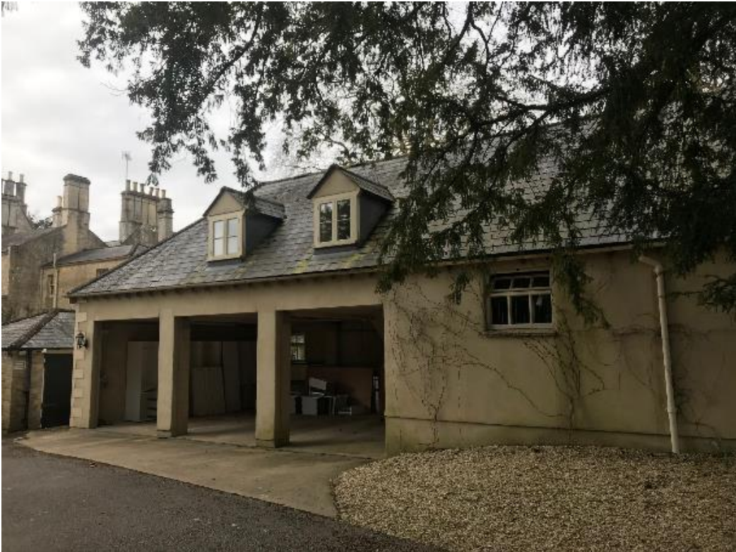
Photograph 10. The south aspect of the Stable Cottage. The area beneath the slate-tiled section contains a roof space. The stone tiles have occasional gaps beneath.