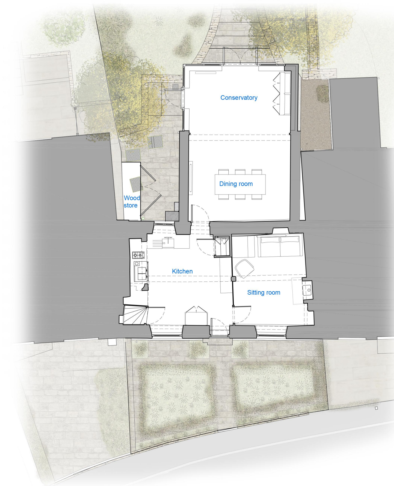
02 Existing Ground Floor Plan 1:100