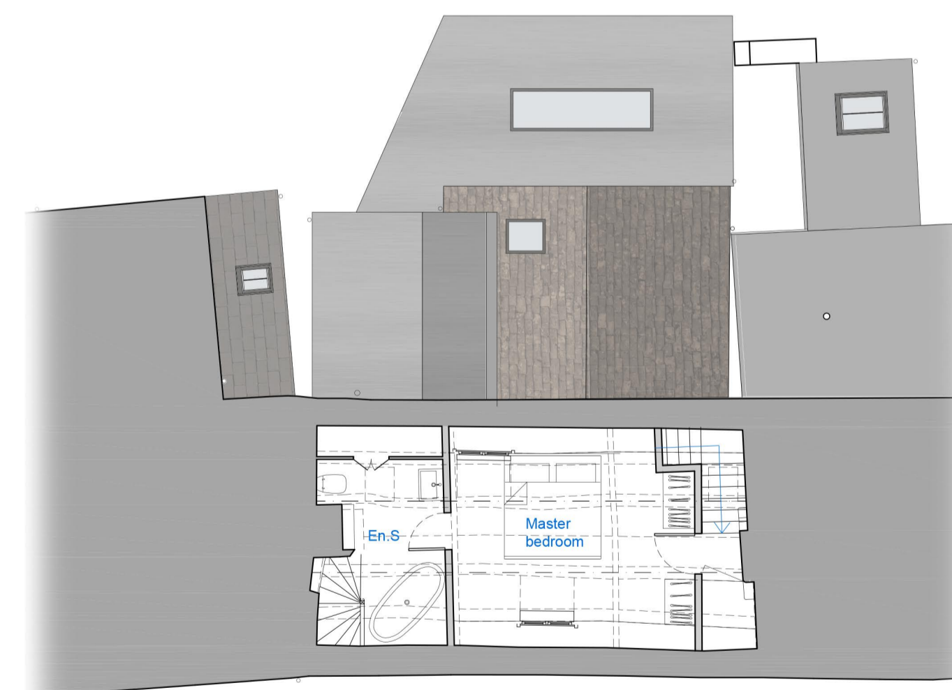
04 Proposed Second Floor Plan 1:100