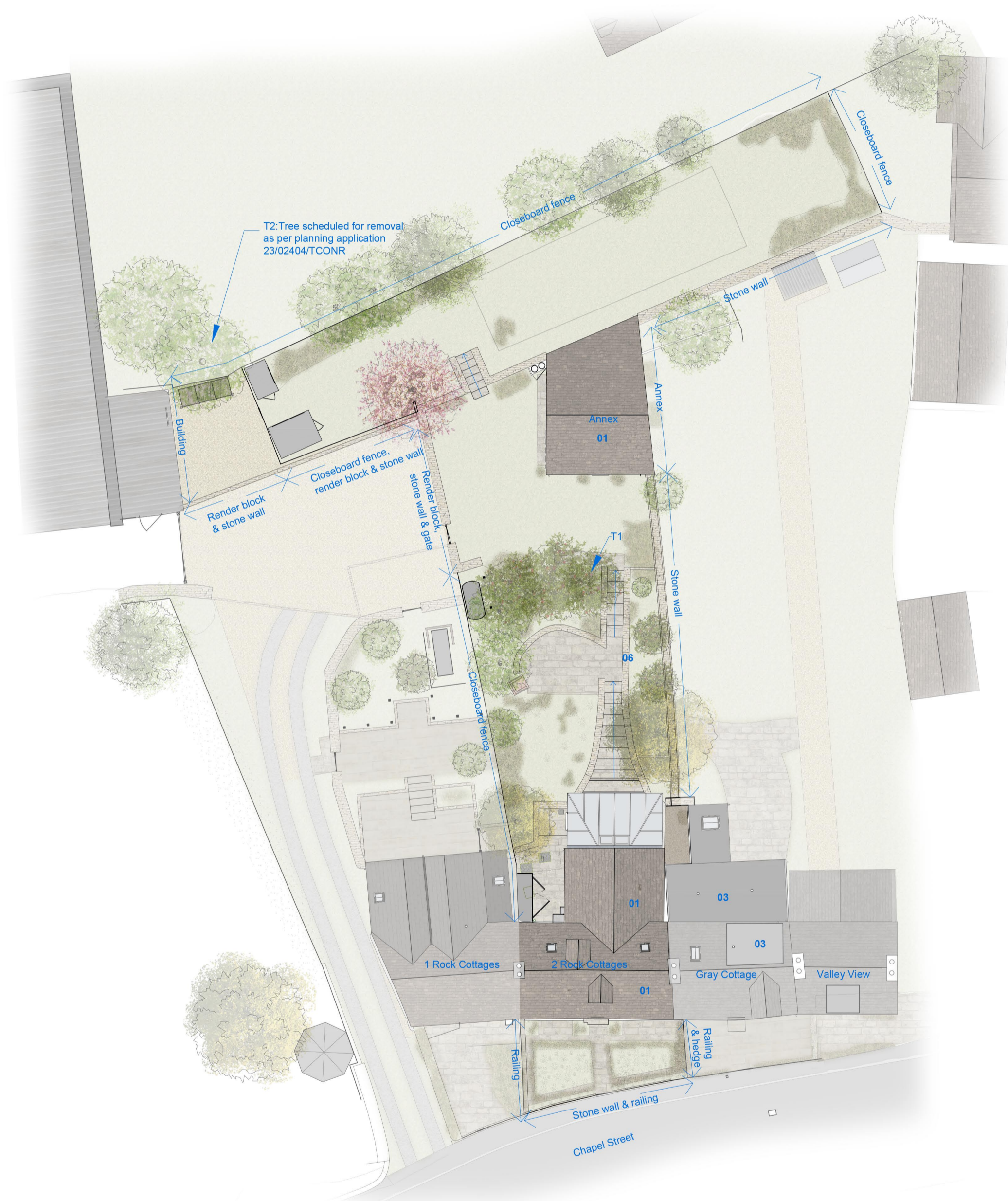
01 Existing Site Plan 1:200