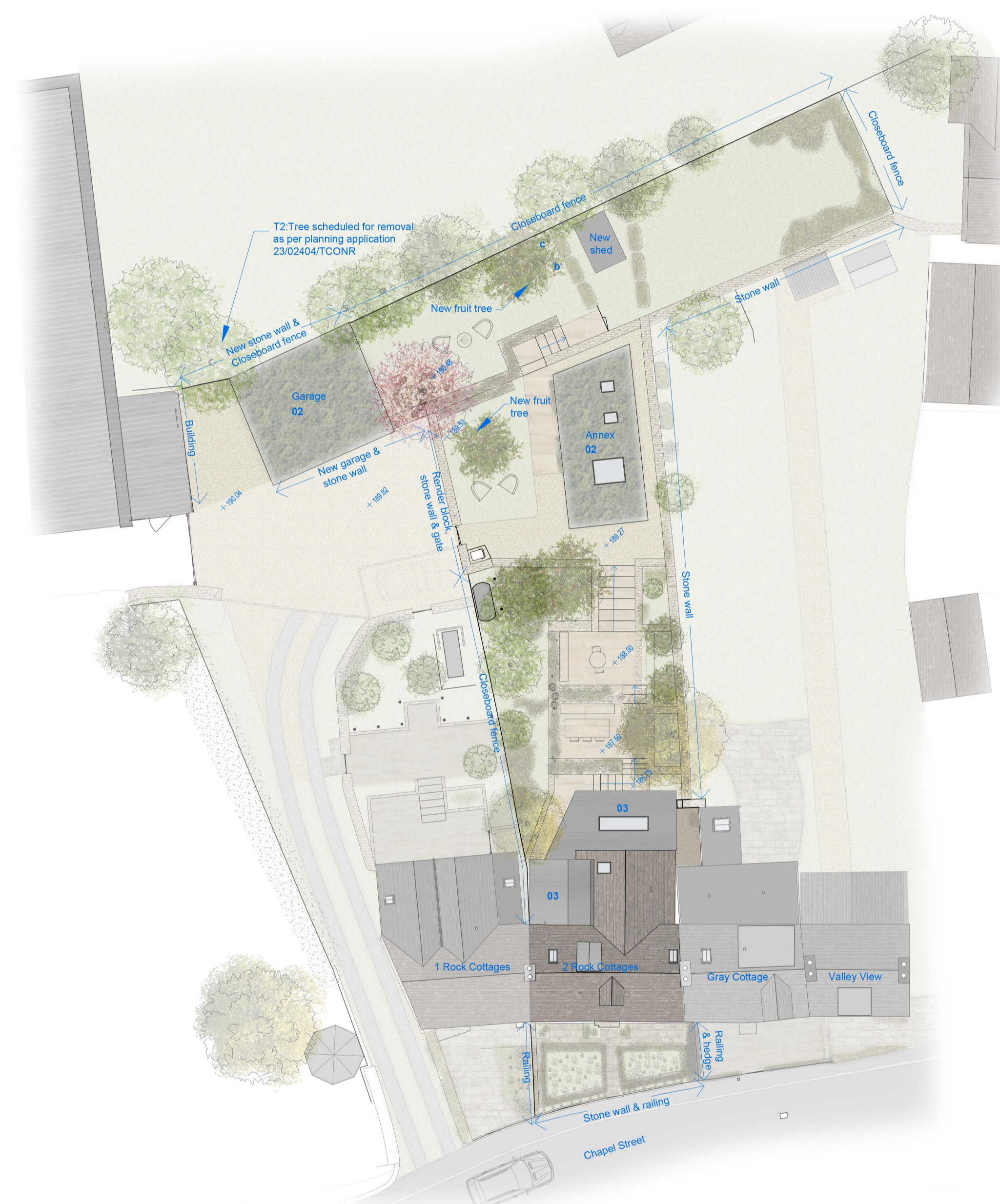
02 Proposed Site Plan 1:200

DRAWING REPRODUCED FROM ORIGINAL SURVEY DRAWINGS BY: EDWARD GARDNER SURVEYS TEL 07775 488916