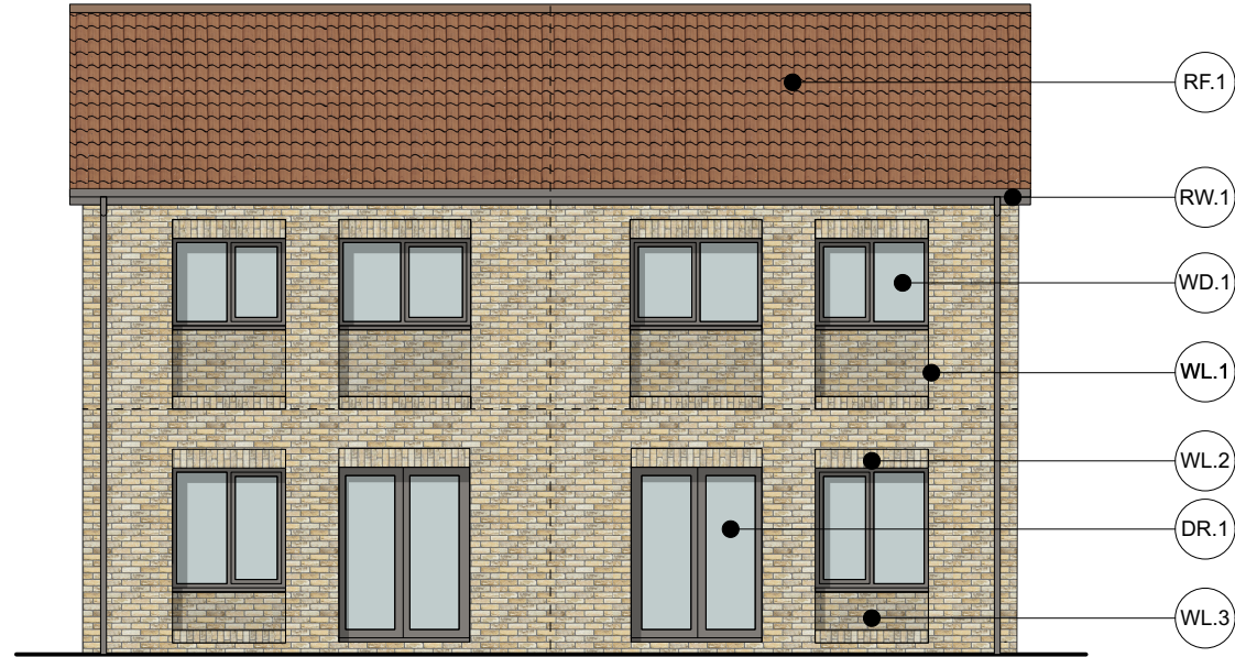
PROPOSED NORTH-WEST ELEVATION 1:100 @A3