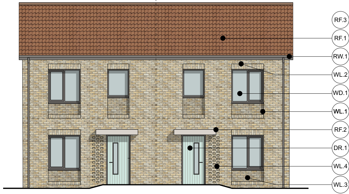
PROPOSED SOUTH-EAST ELEVATION 1:100 @A3