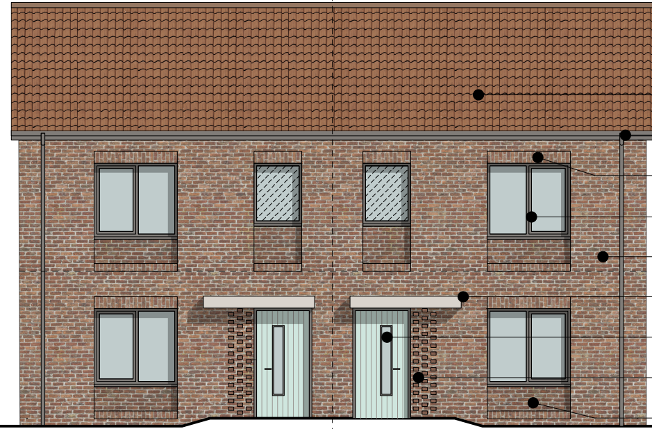
PROPOSED NORTH-EAST ELEVATION 1:100 @A3