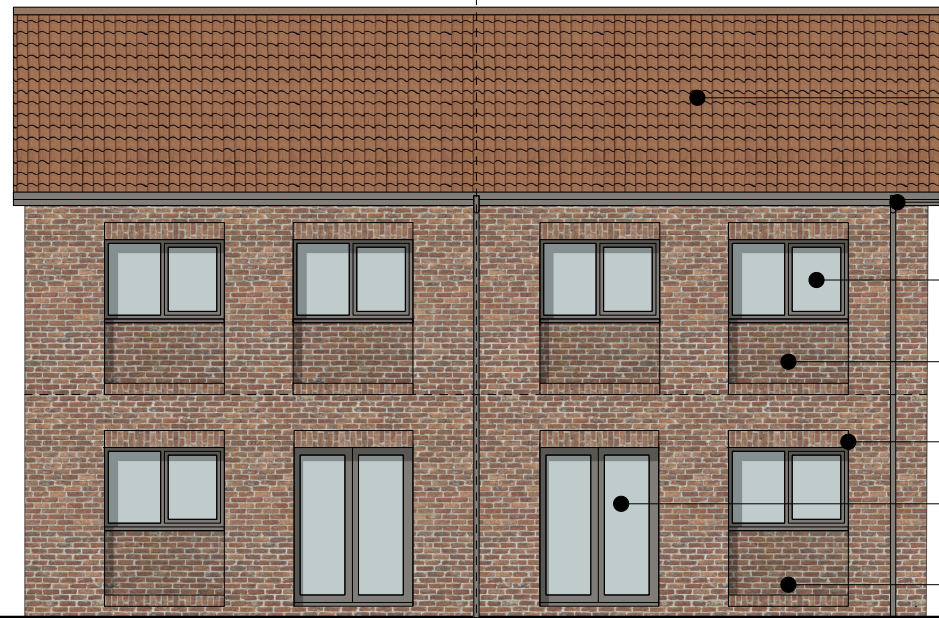
PROPOSED SOUTH-WEST ELEVATION 1:100 @A3