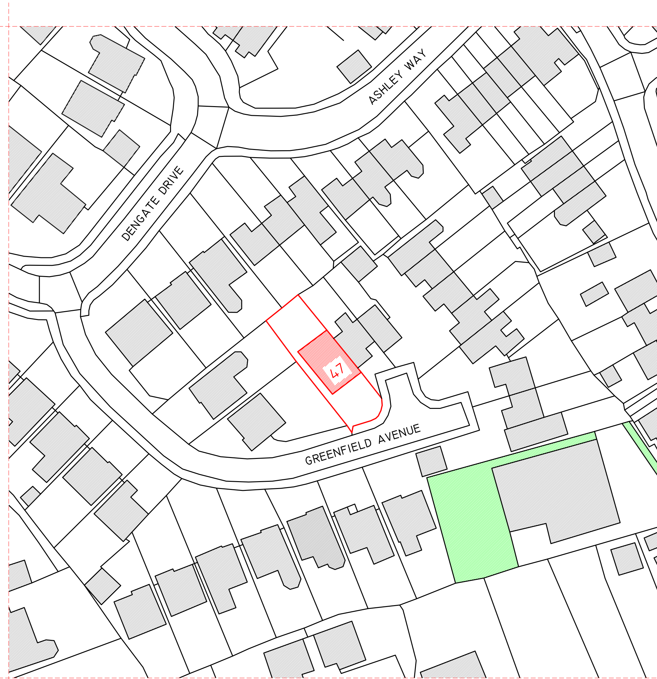
BLOCK PLAN OF THE SITE, PRE-EXISTING PLAN, SCALE 1:500