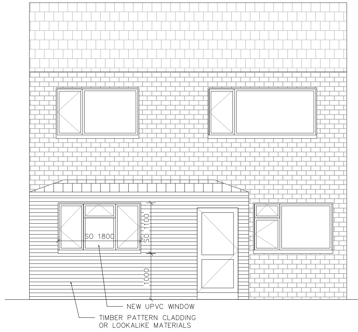
3 PROPOSED CONVERSION FRONT ELEVATION 1:50