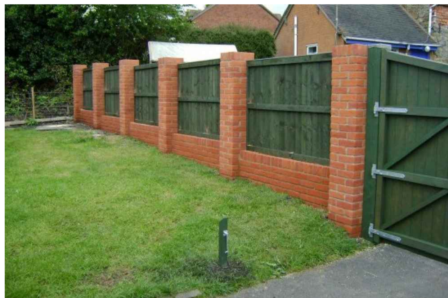
New Brick piers with Close Board Fence panels