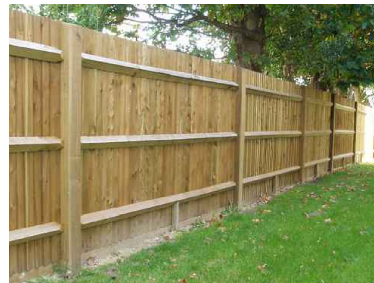
New 1.8m Close Board Fence