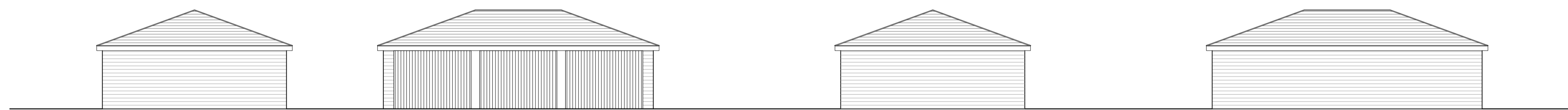
Proposed Garage - Scale 1:100