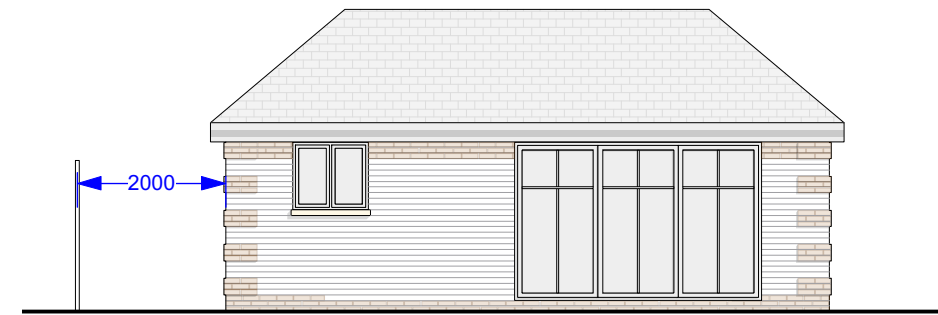
3 SIDE ELEVATION_NORTH SK-52 PROPOSED