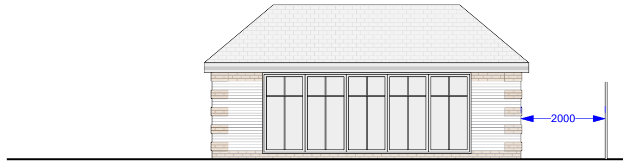
1 FRONT ELEVATION_WEST SK-52 PROPOSED