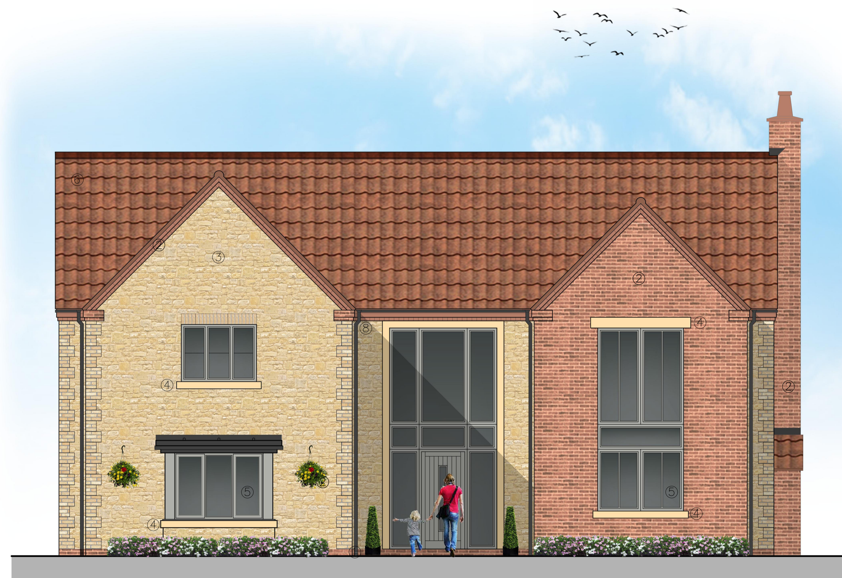
FRONT ELEVATION 1:50 @ A1