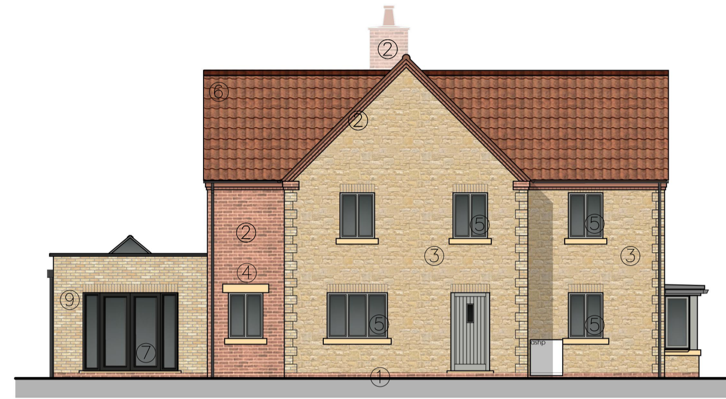
SIDE ELEVATION 1:100 @ A1