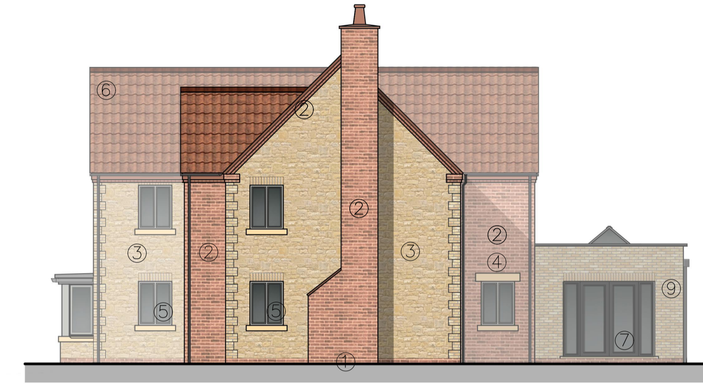
SIDE ELEVATION 1:100 @ A1