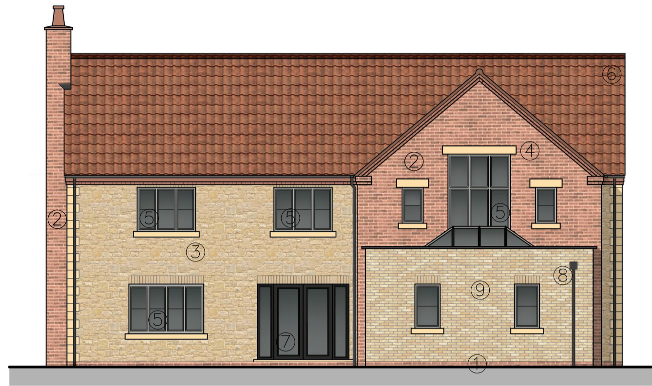
REAR ELEVATION 1:100 @ A1