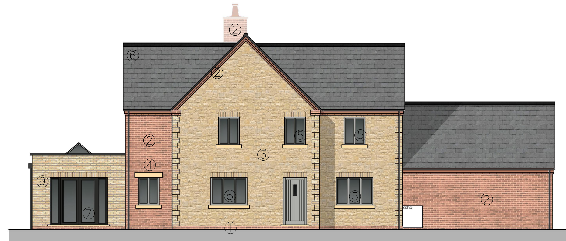
SIDE ELEVATION 1:100 @ A1