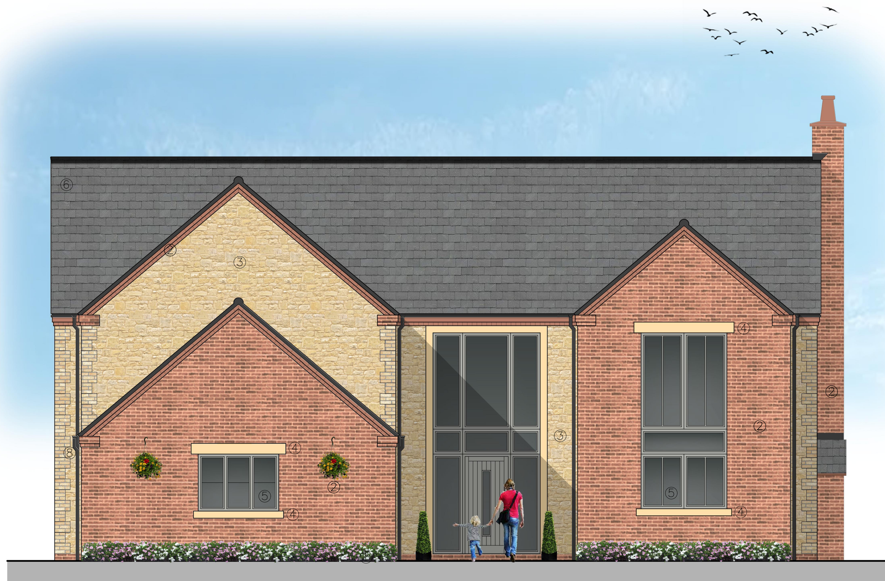
FRONT ELEVATION 1:50 @ A1