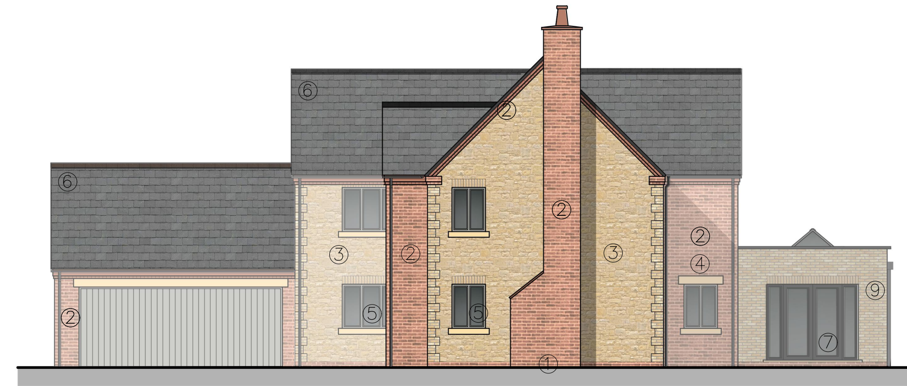
SIDE ELEVATION 1:100 @ A1