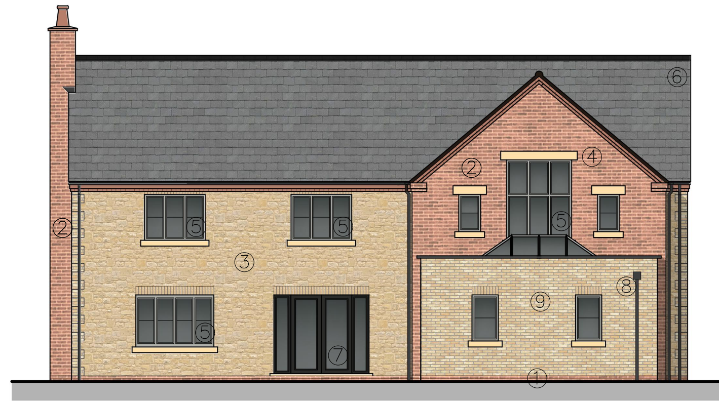
REAR ELEVATION 1:100 @ A1