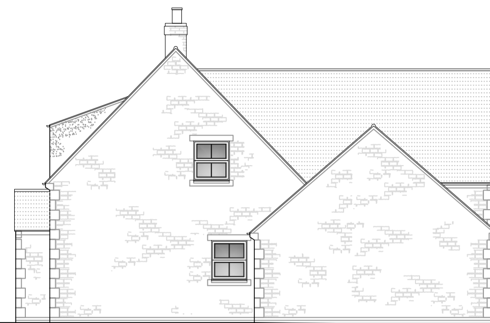
Side (north east)