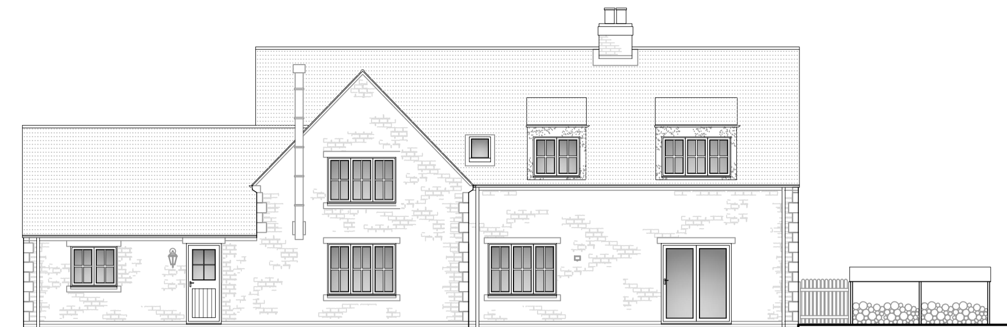
Rear (north west)