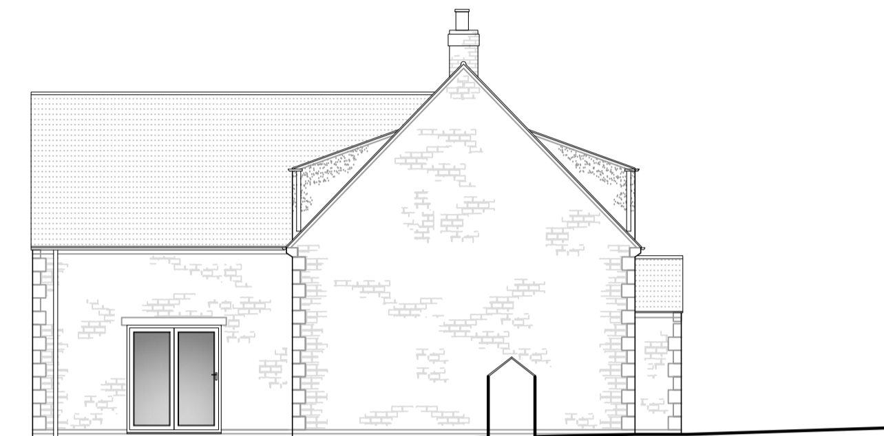
Side (south west)