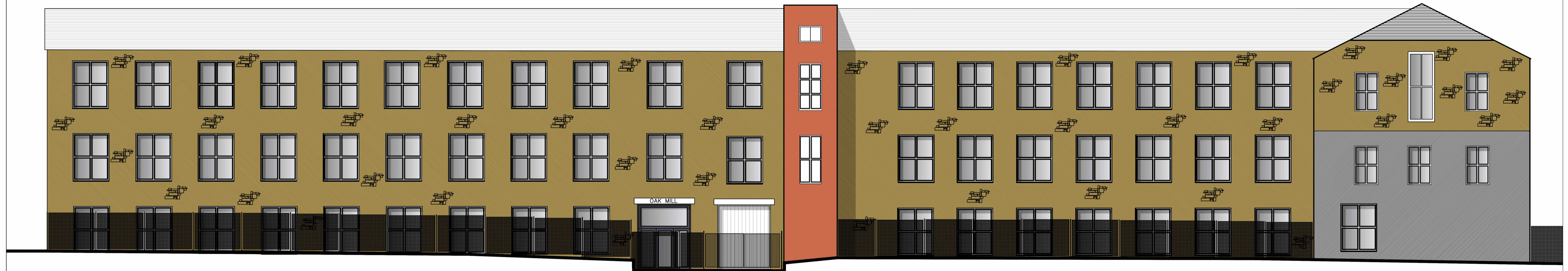
FRONT NORTH WEST ELEVATION (1:100)