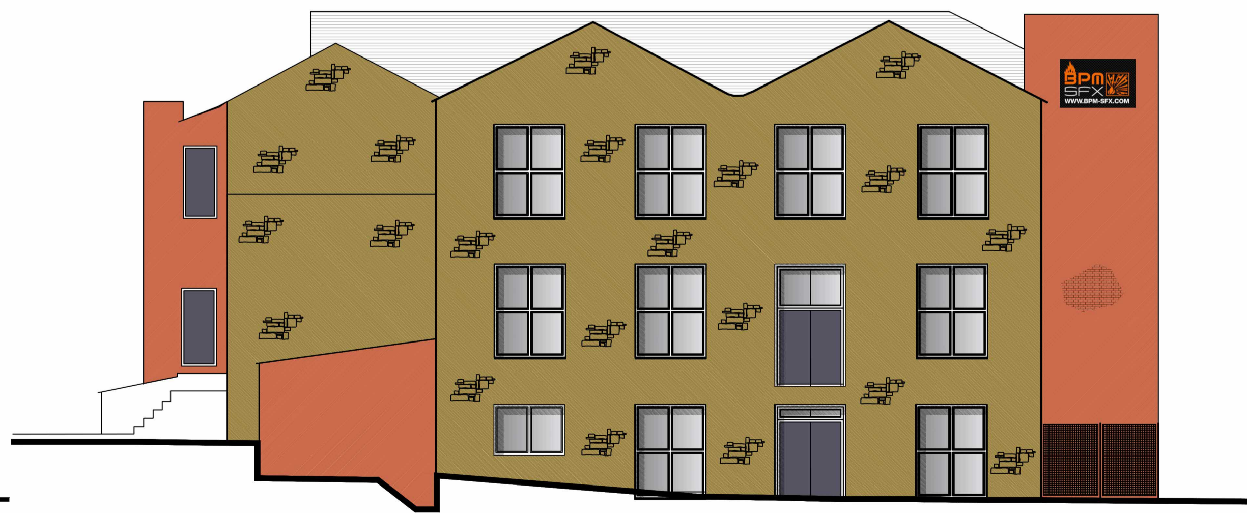
GABLE SOUTH WEST ELEVATION (1:100)