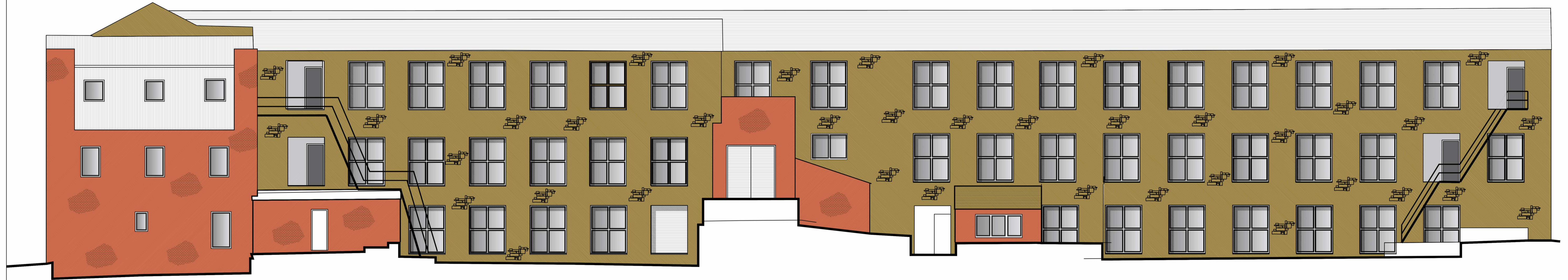
REAR SOUTH EAST ELEVATION (1:100)