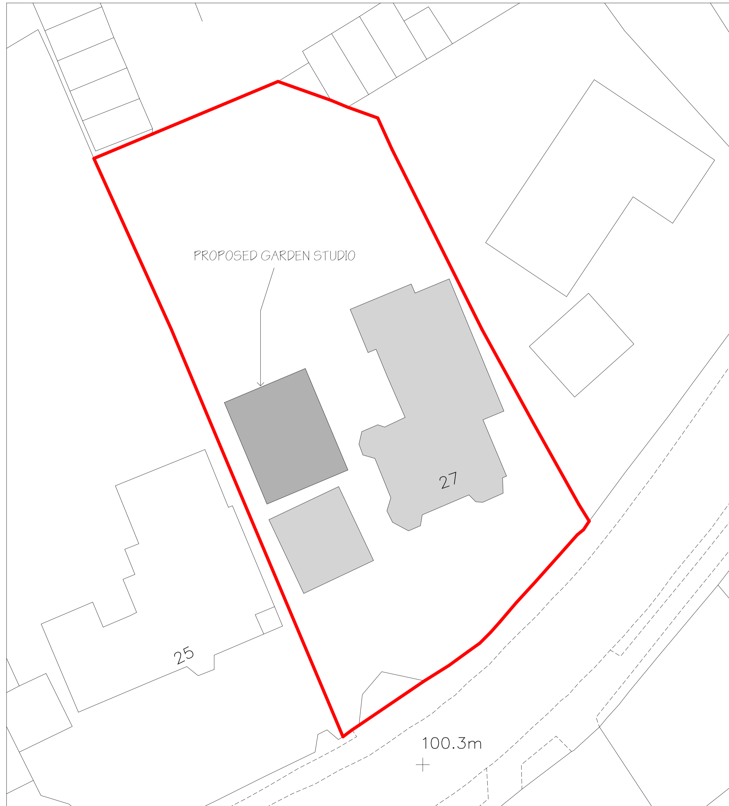
1 PROPOSED SITE PLAN 1:200