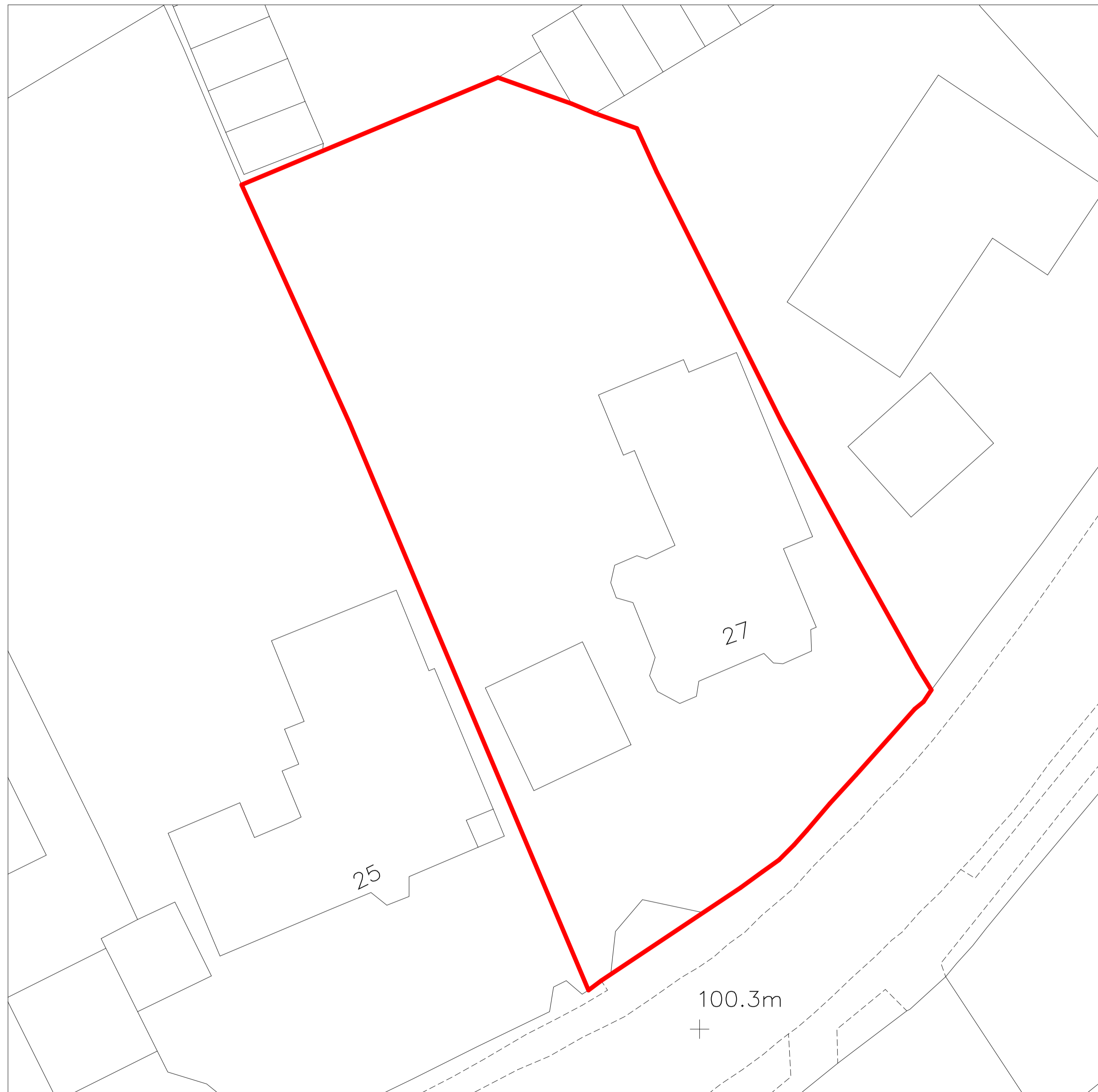
1 EXISTING SITE PLAN 1:200