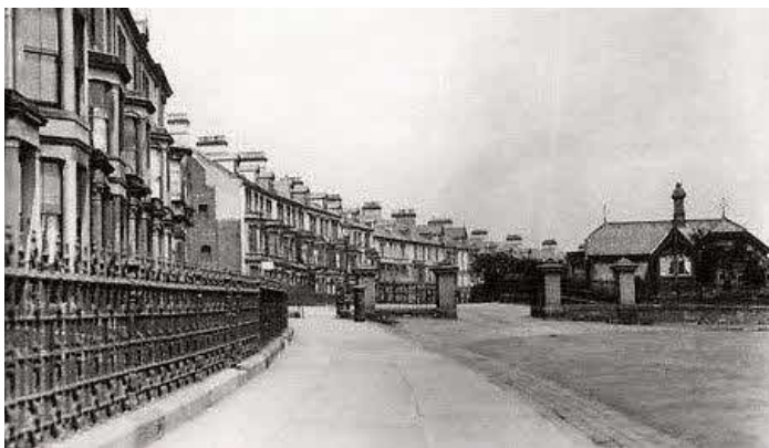
Historic photo of Percy Gardens including No. 2 from c. 1911