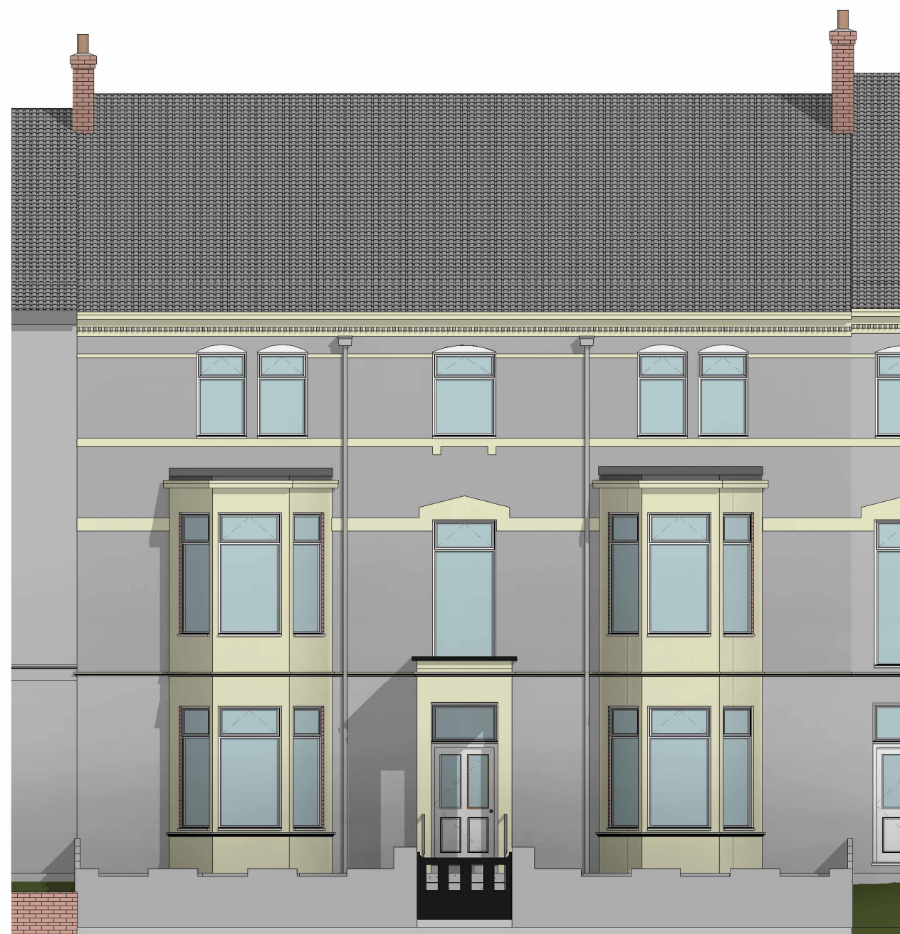
Existing Front Elevation 1 : 100