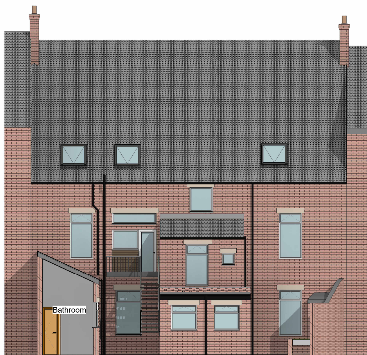
Existing Rear Elevation 1 : 100