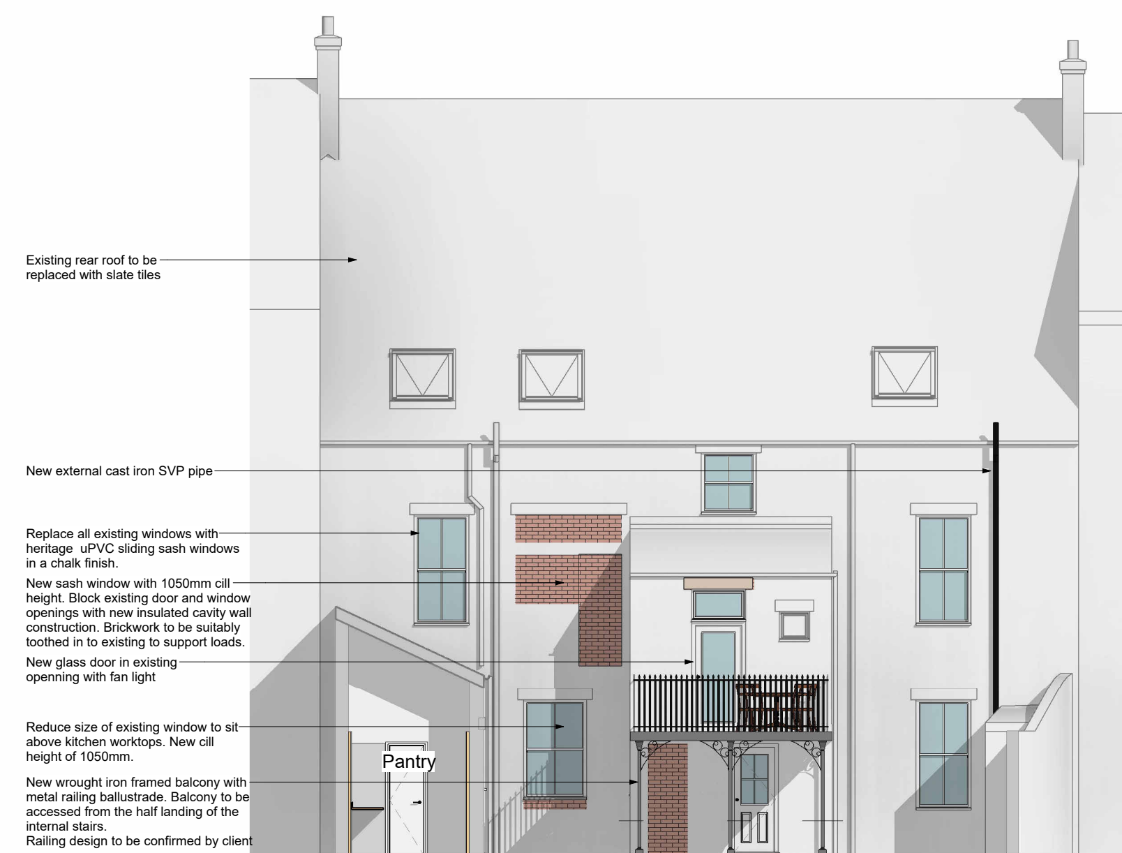
Proposed Rear Elevation 1 : 100