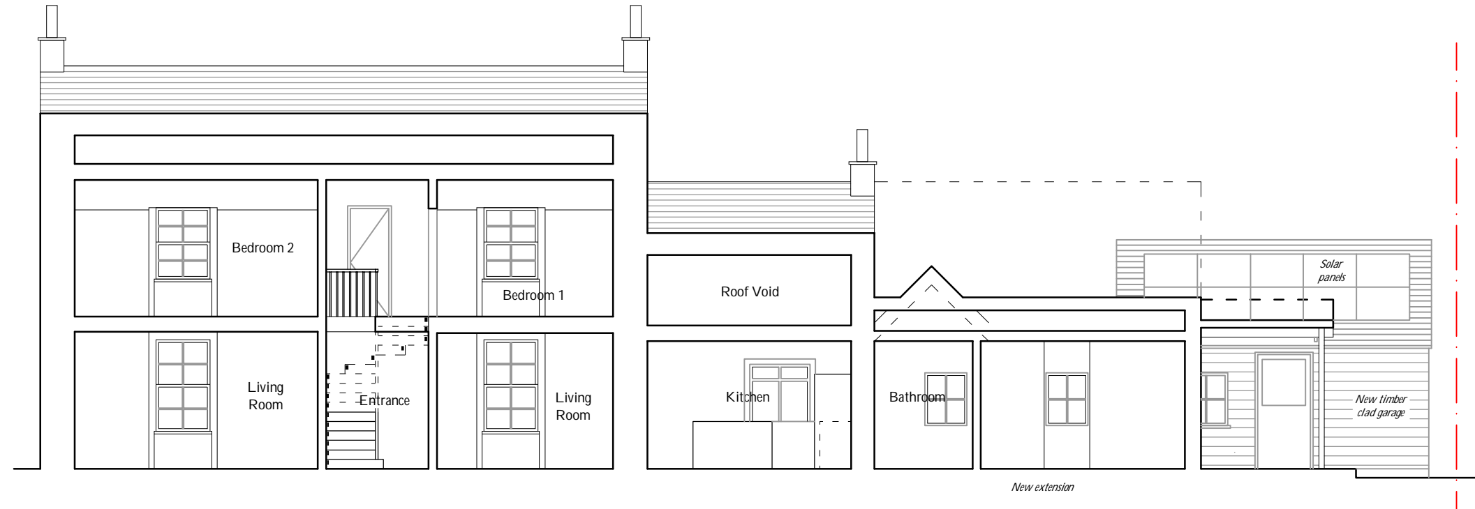
3 Section A-A As Proposed