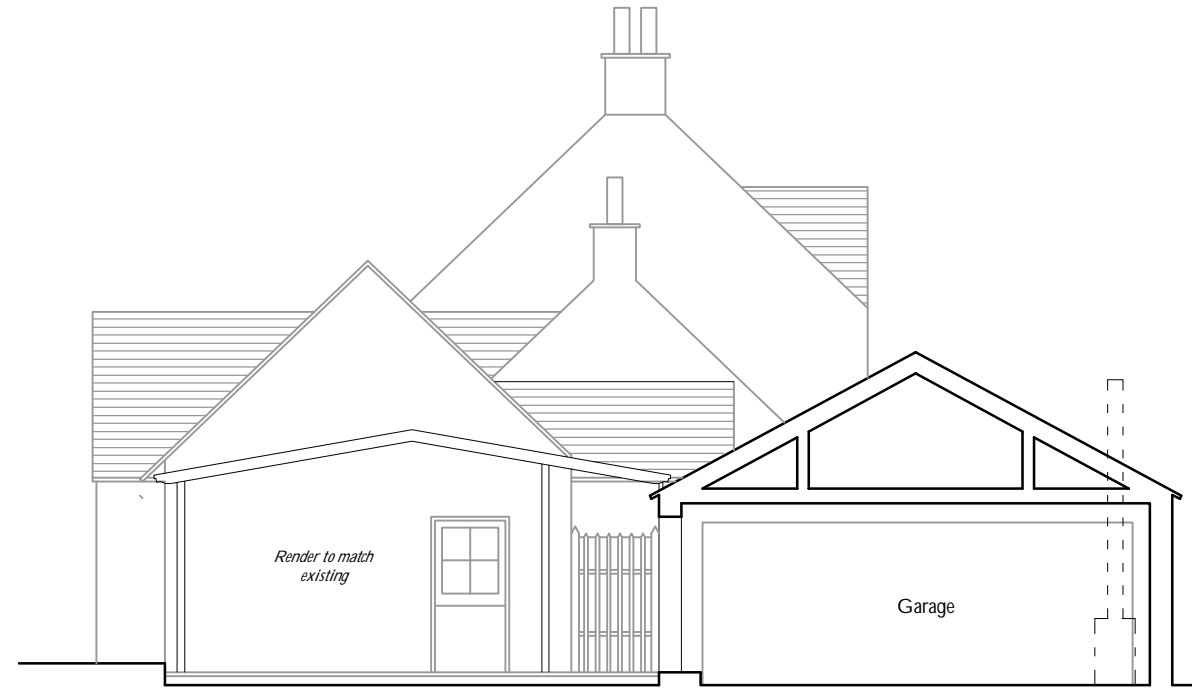
2 Section D-D As Proposed